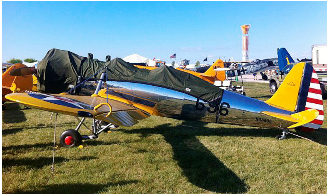
Ryan PT-22 ST3KR Canopy Cover and Engine Cover

water resistance, UV resistance and anti-static buildup. The inner lining is a very soft and smooth microfiber to prevent scratching. The material is very reflective, and tests show that the cabin interior temperature can be reduced to near-ambient temperature on the hottest of days. It is water, ice and snow repellent, yet breathable to allow moisture to escape from between the cover and the aircraft surface.