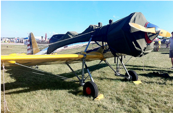
Ryan PT-22 Canopy Cover and Engine Cover