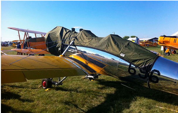
Ryan PT-22 Canopy Cover and Engine Cover

This cover type is made from Silver Acrylic Sunbrella canvas and is 100% lined with a soft and smooth microfiber. Bruce's Custom Covers developed this material combination especially for aircraft protection. The outer material is medium weight and treated for water resistance, UV resistance and anti-static buildup. The inner lining is a very soft and smooth microfiber to prevent scratching. The material is very reflective, and tests show that the cabin interior temperature can be reduced to near-ambient temperature on the hottest of days. It is water, ice and snow repellent, yet breathable to allow moisture to escape from between the cover and the aircraft surface.