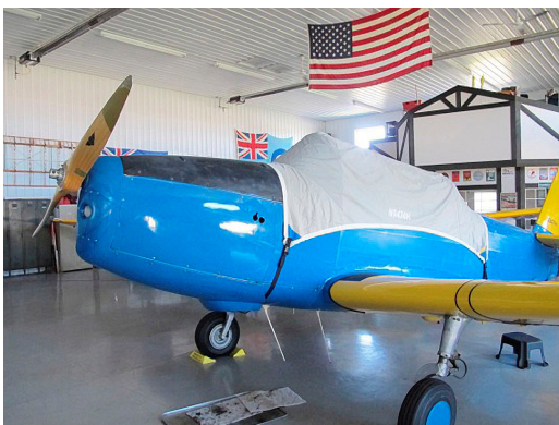
Fairchild PT-26 Canopy Cover

Travel Covers are made with Silver Solution-Dyed Polyester fabric and only lined over the windshield to save weight. The material is lightweight and more compact for easy stowage in the aircraft. The polyester material is water resistant, but only intended for occasional use outside. We also have an ultra lightweight material available for fitted hangar dust covers. For daily outdoor use, the non-travel Sunbrella Cover is the best choice.