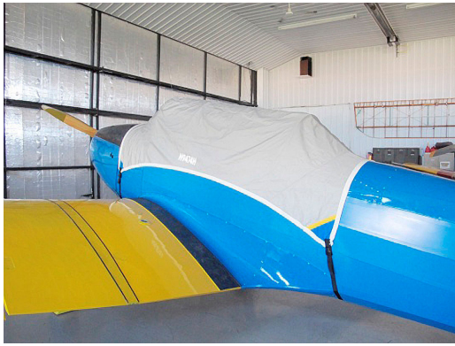
Fairchild PT-26 Canopy Cover