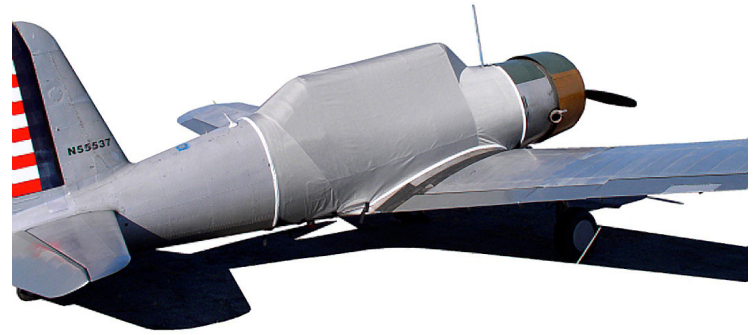
BT-13 Extended Canopy Cover