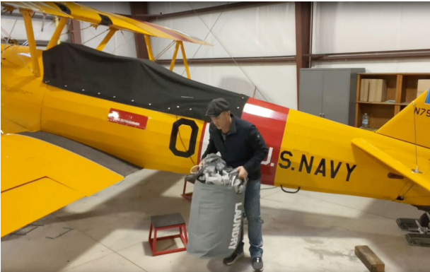
#1: Out of the bag.