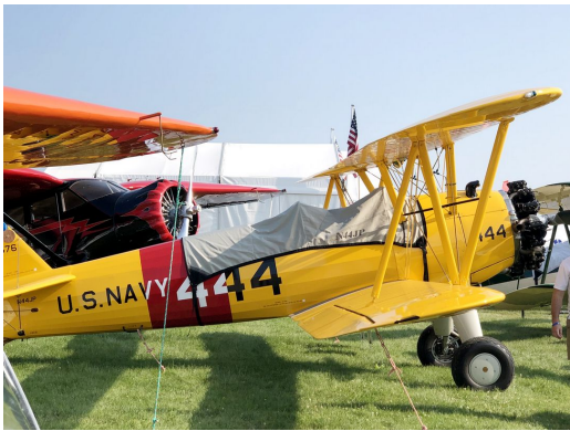
Stearman PT-13 Canopy Cover