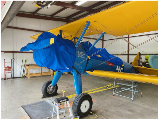
Boeing Stearman PT-13 Canopy, Engine & Prop Covers