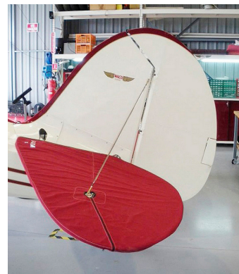
Waco UPF-7 Horizontal Stab. Cover