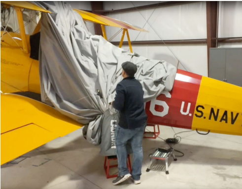
#3: Pull out of the bag, over the plane.

Some high value aircraft end up logging lots of hangar time, and become dust magnets in the process. A high quality, well fitting dust cover provides easy assurance that the aircraft's surfaces remain clean and free of grit and grime. Available in a large variety of colors, each dust cover is custom made according to aircraft details and customer preferences. Fire retardant fabrics are also available.