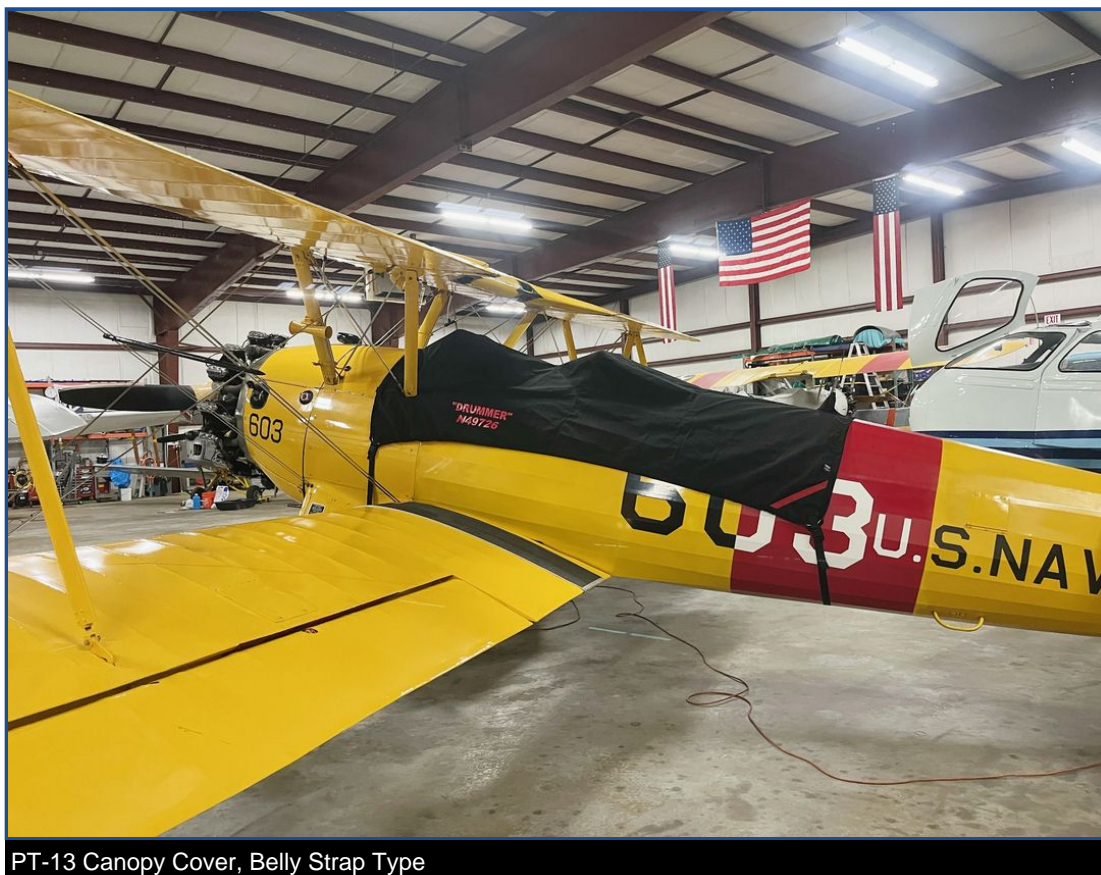
PT-13 Canopy Cover, Belly Strap Type