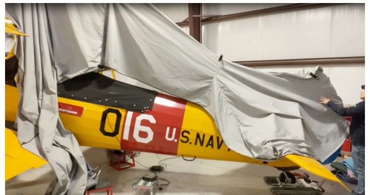
#4: Pull out to the edges.