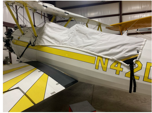
Stearman PT-13 Canopy Cover