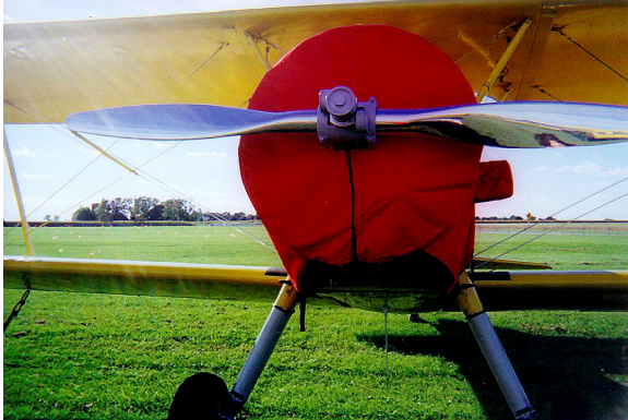
Stearman Engine Cover

This cover type is made from Silver Acrylic Sunbrella canvas and is 100% lined with a soft and smooth microfiber. Bruce's Custom Covers developed this material combination especially for aircraft protection. The outer material is medium weight and treated for water resistance, UV resistance and anti-static buildup. The inner lining is a very soft and smooth microfiber to prevent scratching. The material is very reflective, and tests show that the cabin interior temperature can be reduced to near-ambient temperature on the hottest of days. It is water, ice and snow repellent, yet breathable to allow moisture to escape from between the cover and the aircraft surface.