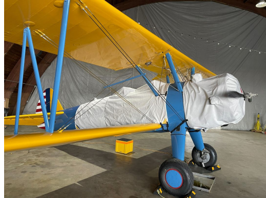
Boeing Stearman Extended Canopy Cover, Engine Cover