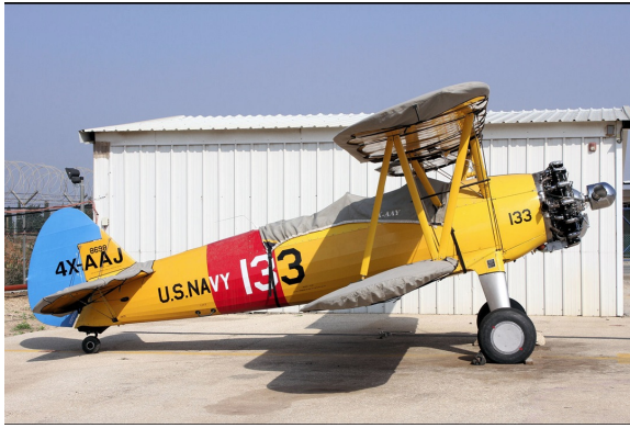
Stearman Canopy, Wings & Horizontal Stab. Covers

the hottest of days. It is water, ice and snow repellent, yet breathable to allow moisture to escape from between the cover and the aircraft surface.