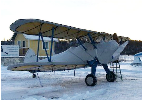
Boeing Stearman PT-13 Winter Cover Set

This cover type is made from Silver Acrylic Sunbrella canvas and is 100% lined with a soft and smooth microfiber. Bruce's Custom Covers developed this material combination especially for aircraft protection. The outer material is medium weight and treated for water resistance, UV resistance and anti-static buildup. The inner lining is a very soft and smooth microfiber to prevent scratching. The material is very reflective, and tests show that the cabin interior temperature can be reduced to near-ambient temperature on the hottest of days. It is water, ice and snow repellent, yet breathable to allow moisture to escape from between the cover and the aircraft surface.