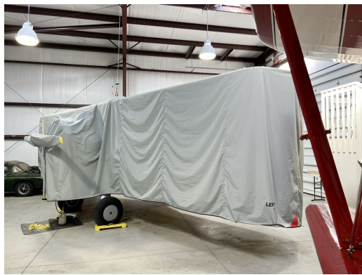
Stearman PT-13 Full Body Dust Cover, Prop Cover Included