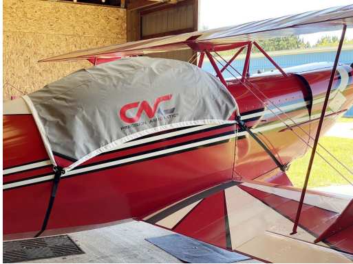
Pitts S2 Travel Canopy Cover

Travel Covers are made with Silver Solution-Dyed Polyester fabric and only lined over the windshield to save weight. The material is lightweight and more compact for easy stowage in the aircraft. The polyester material is water resistant, but only intended for occasional use outside. We also have an ultra lightweight material available for fitted hangar dust covers. For daily outdoor use, the non-travel Sunbrella Cover is the best choice.