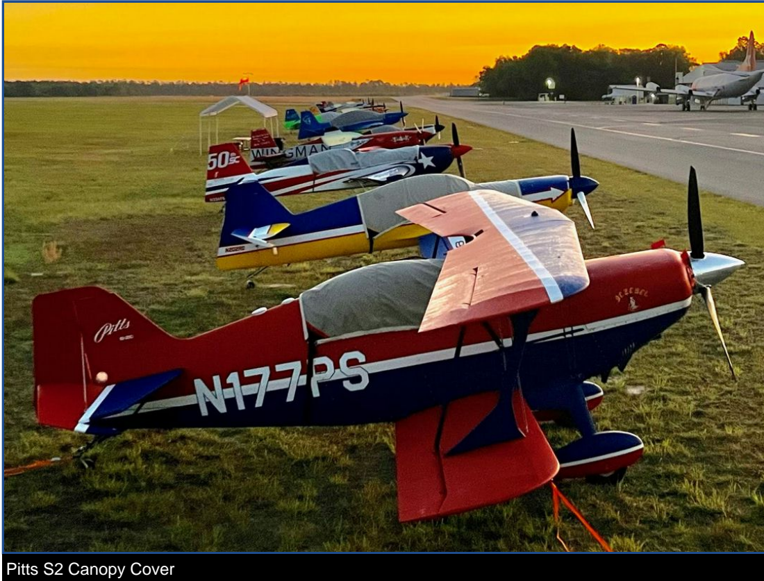
Pitts S2 Canopy Cover