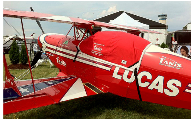
Pitts S2 Canopy Cover