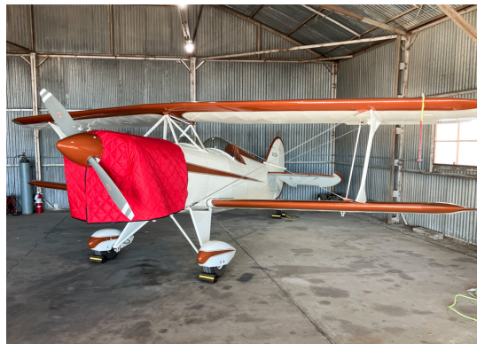
SKYBOLT, Insulated Hangar Blanket, Custom Fit Interior Use)