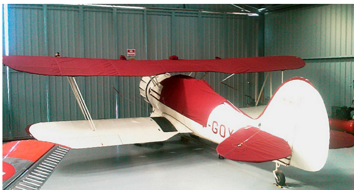
Waco UPF-7 Upper Wing Cover, Horizontal Stabilizer Cover & Canopy Cover