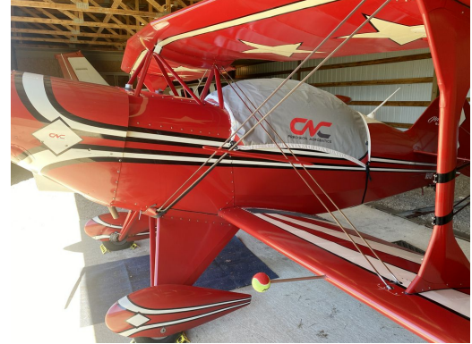
Pitts S2 Travel Canopy Cover