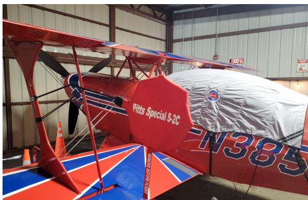
Pitts S2 Acrobatic Sight Cover

ALL-YEAR USE MATERIAL - Made with Silver Acrylic Sunbrella canvas, the all-year use material is the best option for sun protection and cover longevity. This heavier more durable material is intended for all weather conditions, such as rain and snow or lots of sun.