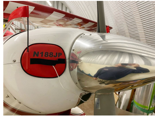
Pitts S-2A Engine Plugs