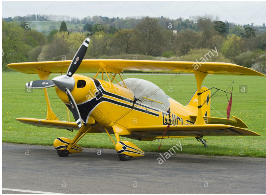
Pitts S2 Canopy Cover