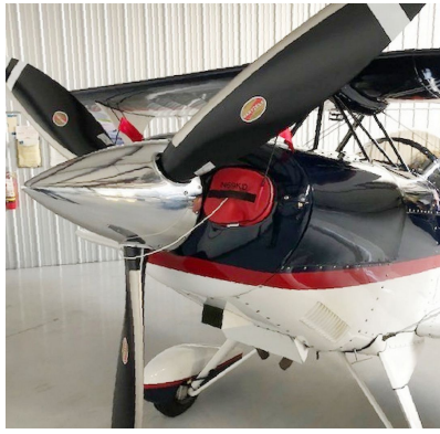
Pitts S2C Engine Inlet Plugs