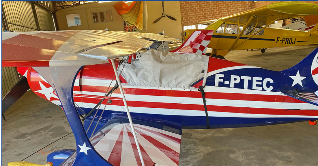
Pitts S1 Canopy Cover (Bubble Canopy Or Open Cockpit Models)