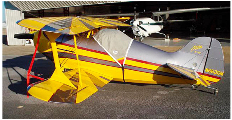
Pitts S1 Canopy Cover