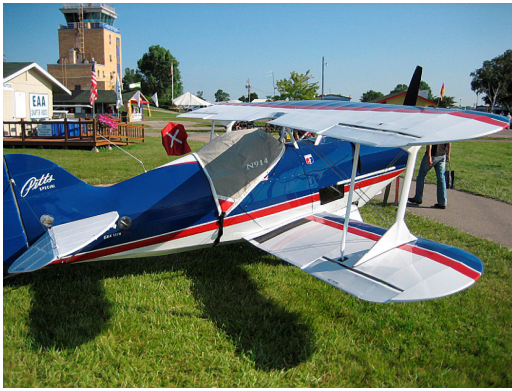
Pitts S1 Canopy Cover