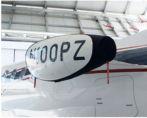
Phenom 100 "Bikini" Engine Covers

imprinted with the aircraft registration number in black. Engine plugs may be inserted after flight when the engine is still warm. Engine Inlet Plugs are commonly referred to as Cowl Plugs, Intake Plugs, Cowl Blocks, Engine Blocks, and Engine Bungs.