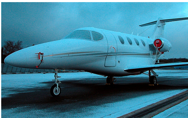
Premier Intake Plugs & Pitot Covers

The Hawker Beechcraft Premier 390 Intake/Exhaust Plugs are custom fit for the intake and exhaust openings, made with heavy-duty vinyl material, and stuffed with a single block of sculpted urethane foam. Each plug has a zipper that allows the foam to be removed and dried if necessary. Engine plugs have 'remove before flight' streamers sewn onto the face of the plugs. Most plugs are imprinted with the aircraft registration number in black. Engine plugs may be inserted after flight when the engine is still warm. Engine Inlet Plugs are commonly referred to as Cowl Plugs, Intake Plugs, Cowl Blocks, Engine Blocks, and Engine Bungs.