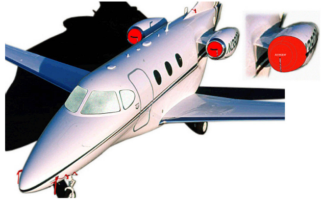
Premier Intake Plugs, Intake Covers, Pitot Covers & Cockpit HeatShields