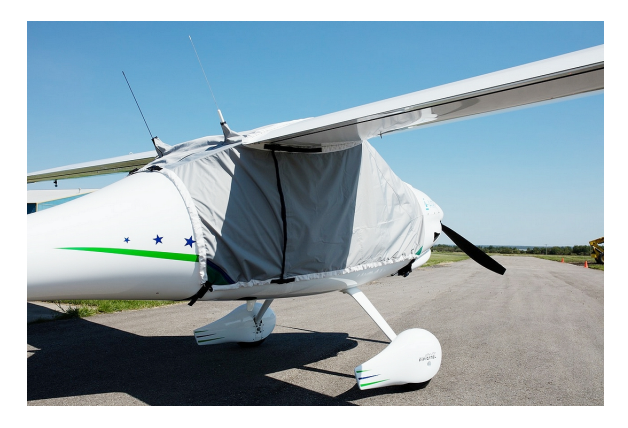
Pipistrel Light Weight Travel Canopy Cover