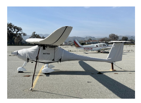
Pipistrel SINUS Canopy/Engine Cover