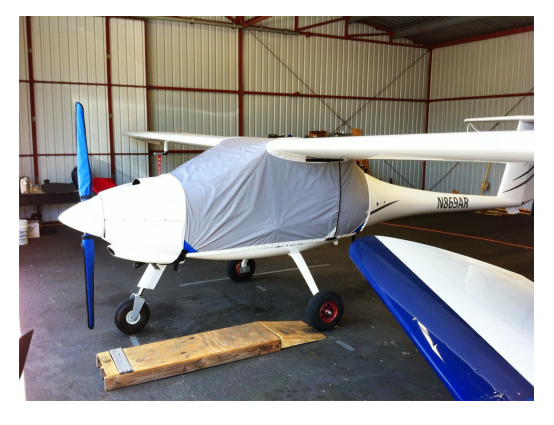
Pipistrel Light Weight Travel Canopy Cover

Travel Covers are made with Silver Solution-Dyed Polyester fabric and only lined over the windshield to save weight. The material is lightweight and more compact for easy stowage in the aircraft. The polyester material is water resistant, but only intended for occasional use outside. We also have an ultra lightweight material available for fitted hangar dust covers. For daily outdoor use, the non-travel Sunbrella Cover is the best choice.