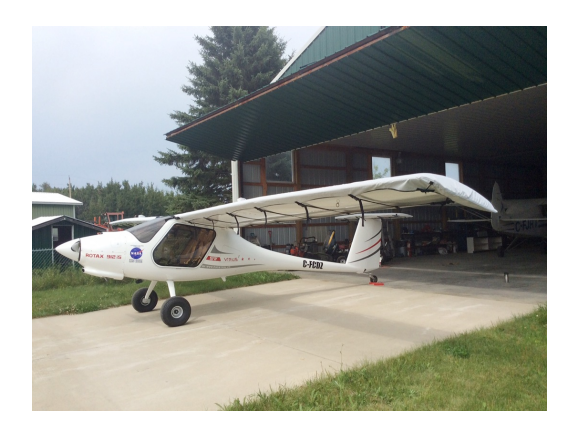
Pipistrel Virus Wing & Horizontal Stab. Covers

WINTER USE MATERIAL - Made with Solution-Dyed Polyester fabric, this option is intended for seasonal use to aid in deicing, rain mitigation, or for occasional travel. The material is lighter and more compact, but more susceptible to UV damage and may have a shorter useful life if used continuously outside than the all-year use material.