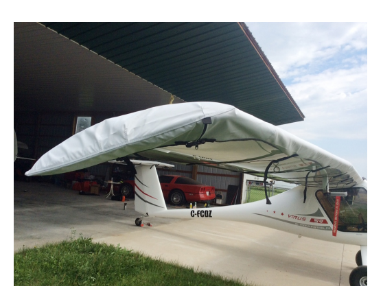
Pipistrel Virus Wing & Horizontal Stab. Covers