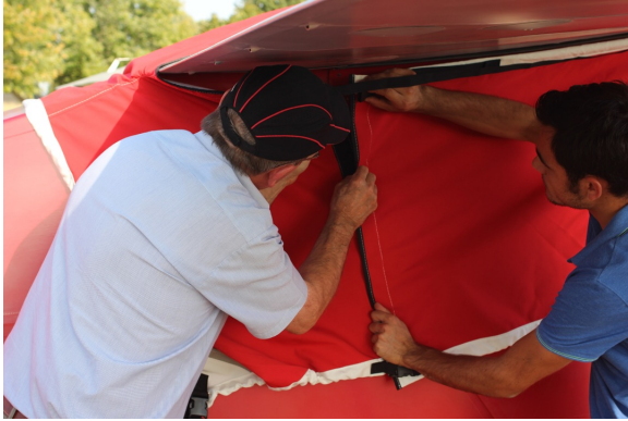
Porterfield Collegiate Canopy Cover

water resistance, UV resistance and anti-static buildup. The inner lining is a very soft and smooth microfiber to prevent scratching. The material is very reflective, and tests show that the cabin interior temperature can be reduced to near-ambient temperature on the hottest of days. It is water, ice and snow repellent, yet breathable to allow moisture to escape from between the cover and the aircraft surface.