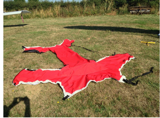
Porterfield Collegiate Canopy Cover