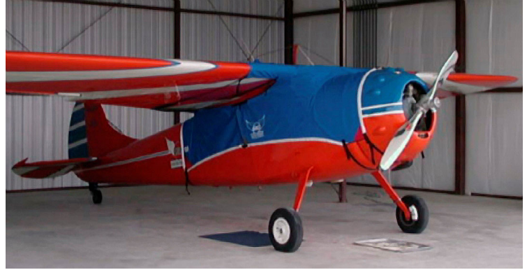
Cessna 195 Canopy Cover, extended forward and over gas caps Cessna 195 Canopy Cover, extended forward and over gas caps