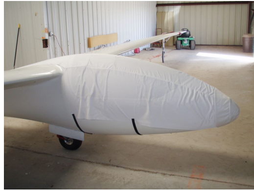
Bolkow Phoebus C-1 Canopy/Nose Cover, test fit cover