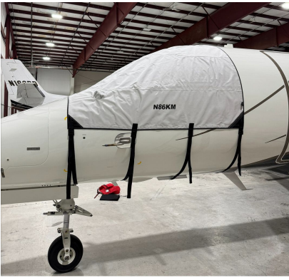
Phenom 300 Cockpit Cover