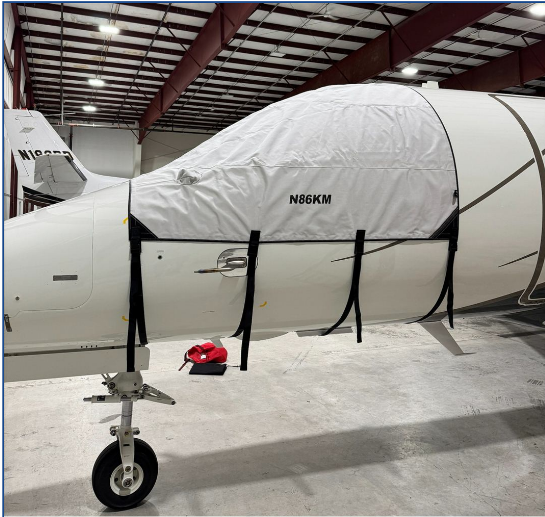
Phenom 300 Cockpit Cover