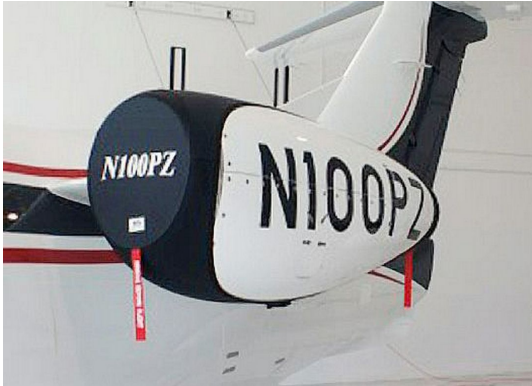
Phenom 100 "Bikini" Engine Covers

The Embraer Phenom 300 (EMB-505) Intake/Exhaust Plugs are custom fit for the intake and exhaust openings, made with heavy-duty vinyl material, and stuffed with a single block of sculpted urethane foam. Each plug has a zipper that allows the foam to be removed and dried if necessary. Engine plugs have 'remove before flight' streamers sewn onto the face of the plugs. Most plugs are imprinted with the aircraft registration number in black. Engine plugs may be inserted after flight when the engine is still warm. Engine Inlet Plugs are commonly referred to as Cowl Plugs, Intake Plugs, Cowl Blocks, Engine Blocks, and Engine Bungs.