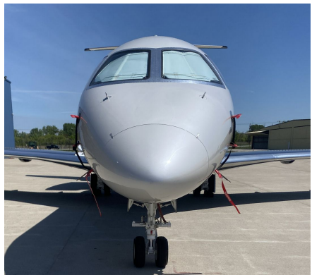
Embraer 505 Phenom 300 Cockpit HeatShields

Cockpit Heatshields are interior sunshades for the aircraft's cockpit. The product is a unique composite of closed-cell foam with a silver mylar finish. The semi-rigid design is stiff enough to stand inside the window framing. The set folds up flat and is easily stored in the included storage sleeve. Some designs may require velcro and suction cups. Our Heatshields for jets are offered white side out because some aircraft manufacturers have issued advisories against reflective window inserts due to potential heat damage. A Heatshield is an excellent short-term remedy for cockpit overheating, but an external fabric cover is more effective for long-term protection.