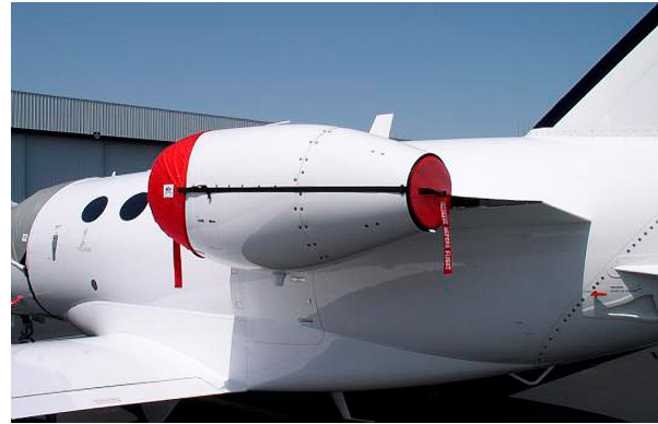
Cessna Mustang Intake/Exhaust Plug Set