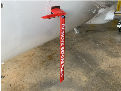
Embraer Phenom 300 Pitot Covers

aircraft registration number in black for an extra charge. Storage bag NOT included. Engine plugs may be inserted after flight when the engine is still warm. Engine Inlet Plugs are commonly referred to as Cowl Plugs, Intake Plugs, Cowl Blocks, Engine Blocks, and Engine Bunges.