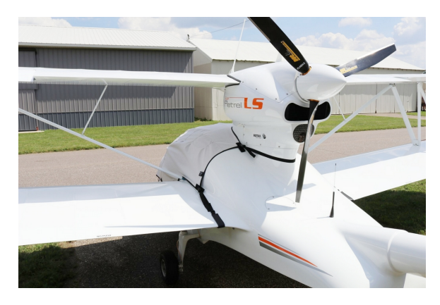
Scoda Aeronautica Super Petrel Canopy/Nose Cover