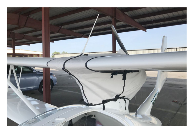
Scoda Aeronautica Super Petrel Engine Cover