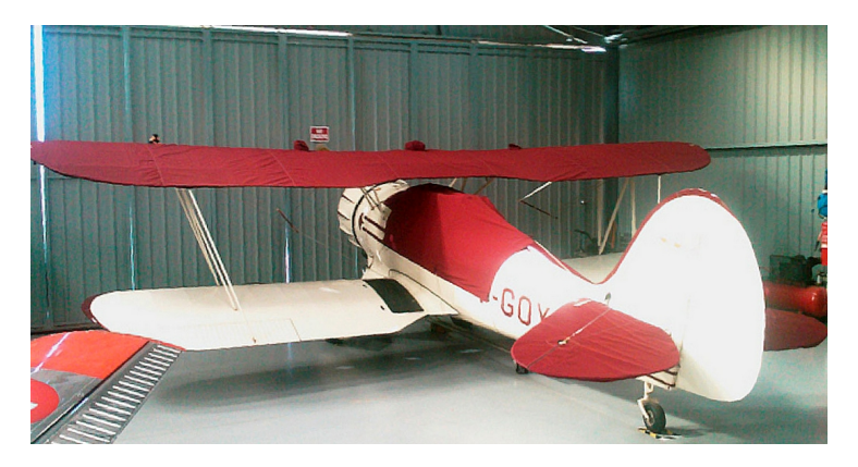
Waco UPF-7 Upper Wing Cover, Horizontal Stabilizer Cover & Canopy Cover

WINTER USE MATERIAL - Made with Solution-Dyed Polyester fabric, this option is intended for seasonal use to aid in deicing, rain mitigation, or for occasional travel. The material is lighter and more compact, but more susceptible to UV damage and may have a shorter useful life if used continuously outside than the all-year use material.