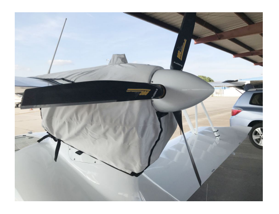
Scoda Aeronautica Super Petrel Engine Cover

Insulated Covers Material - A special composite material of solution-dyed polyester, 3M Thinsulate insulation, and soft nylon interior fabric. Our insulated covers are designed to complement an engine preheater and help retain heat in the engine compartment after shutdown. If you operate your aircraft in cold-weather, these covers will help prevent engine wear and tear.