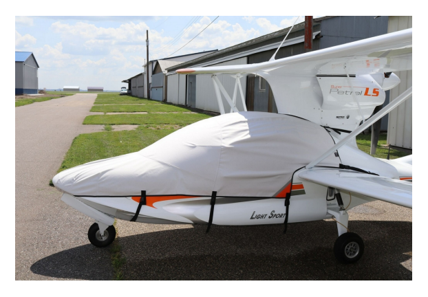
Scoda Aeronautica Super Petrel Canopy/Nose Cover

Travel Covers are made with Silver Solution-Dyed Polyester fabric and only lined over the windshield to save weight. The material is lightweight and more compact for easy stowage in the aircraft. The polyester material is water resistant, but only intended for occasional use outside. We also have an ultra lightweight material available for fitted hangar dust covers. For daily outdoor use, the non-travel Sunbrella Cover is the best choice.