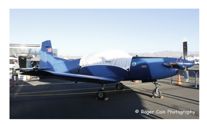
Pilatus PC-7 Canopy Cover

Travel Covers are made with Silver Solution-Dyed Polyester fabric and only lined over the windshield to save weight. The material is lightweight and more compact for easy stowage in the aircraft. The polyester material is water resistant, but only intended for occasional use outside. We also have an ultra lightweight material available for fitted hangar dust covers. For daily outdoor use, the non-travel Sunbrella Cover is the best choice.