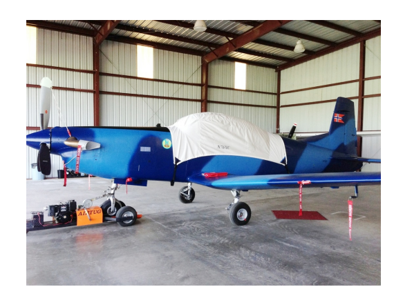
Pilatus PC-7 Canopy Cover