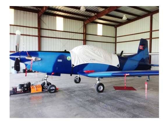
Pilatus PC-7 Canopy Cover