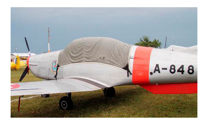
Pilatus P-3 Canopy Cover

This cover type is made from Silver Acrylic Sunbrella canvas and is 100% lined with a soft and smooth microfiber. Bruce's Custom Covers developed this material combination especially for aircraft protection. The outer material is medium weight and treated for water resistance, UV resistance and anti-static buildup. The inner lining is a very soft and smooth microfiber to prevent scratching. The material is very reflective, and tests show that the cabin interior temperature can be reduced to near-ambient temperature on the hottest of days. It is water, ice and snow repellent, yet breathable to allow moisture to escape from between the cover and the aircraft surface.