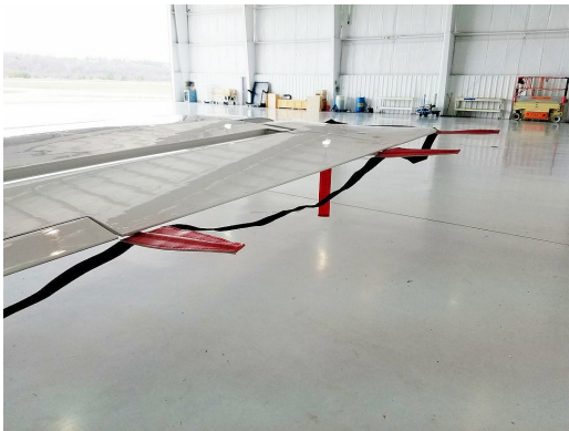
Hawker Beechcraft 800, 800XP, 850XP Static Wick Protectors