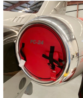
Pilatus PC-24 Engine Intake Plug