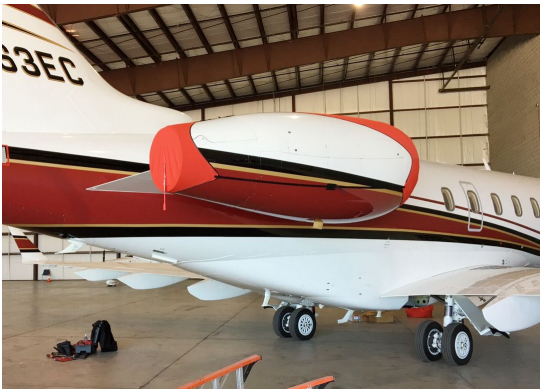
Canadair Challenger 300 Intake/Exhaust Covers, 3-Strap Type

The Pilatus PC-24 Intake/Exhaust Plugs are custom fit for the intake and exhaust openings, made with heavy-duty vinyl material, and stuffed with a single block of sculpted urethane foam. Each plug has a zipper that allows the foam to be removed and dried if necessary. Engine plugs have 'remove before flight' streamers sewn onto the face of the plugs. Most plugs are imprinted with the aircraft registration number in black. Engine plugs may be inserted after flight when the engine is still warm. Engine Inlet Plugs are commonly referred to as Cowl Plugs, Intake Plugs, Cowl Blocks, Engine Blocks, and Engine Bungs.