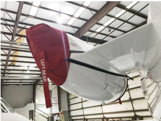
Pilatus PC-24 Engine Cover Set, Tri-Fold Type