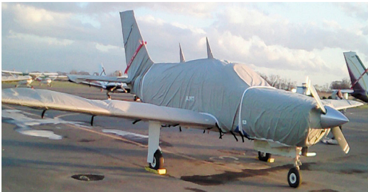
Piper PA-46 Malibu Complete Cover Set

WINTER USE MATERIAL - Made with Solution-Dyed Polyester fabric, this option is intended for seasonal use to aid in deicing, rain mitigation, or for occasional travel. The material is lighter and more compact, but more susceptible to UV damage and may have a shorter useful life if used continuously outside than the all-year use material.