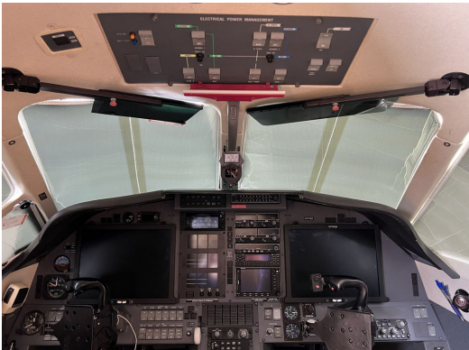
Pilatus PC-12 Cockpit HeatShields