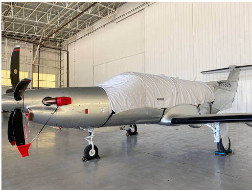
Pilatus PC-12, U-28A, NGX Cockpit Cover, Snap-On Type

This cover type is made from Silver Acrylic Sunbrella canvas and is 100% lined with a soft and smooth microfiber. Bruce's Custom Covers developed this material combination especially for aircraft protection. The outer material is medium weight and treated for water resistance, UV resistance and anti-static buildup. The inner lining is a very soft and smooth microfiber to prevent scratching. The material is very reflective, and tests show that the cabin interior temperature can be reduced to near-ambient temperature on the hottest of days. It is water, ice and snow repellent, yet breathable to allow moisture to escape from between the cover and the aircraft surface.