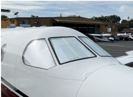
Pilatus PC-12 Cockpit HeatShields

Cockpit Heatshields are interior sunshades for the aircraft's cockpit. The product is a unique composite of closed-cell foam with a silver mylar finish. The semi-rigid design is stiff enough to stand inside the window framing. The set folds up flat and is easily stored in the included storage sleeve. Some designs may require velcro and suction cups. A Heatshield is an excellent short-term remedy for cockpit overheating, but an external fabric cover is more effective for long-term protection.