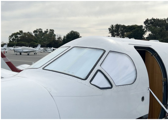
Pilatus PC-12 Cockpit HeatShields