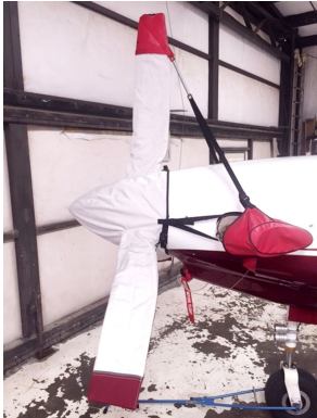
Pilatus PC-12 Prop Cover, Prop Tie/Exhaust Cover