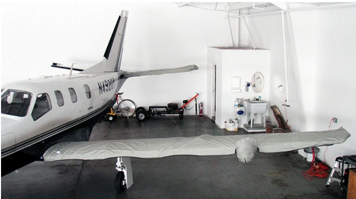
Pilatus PC-12 Wing Covers