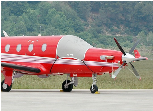
Pilatus PC-12 Windshield Cover