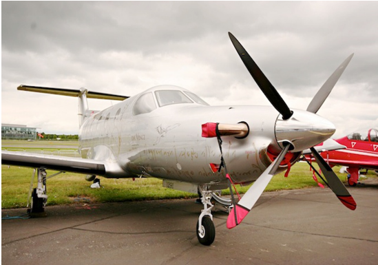
Pilatus PC-12 Engine Plugs, Prop Tie/Exhaust Covers

This cover type is made from Silver Acrylic Sunbrella canvas and is 100% lined with a soft and smooth microfiber. Bruce's Custom Covers developed this material combination especially for aircraft protection. The outer material is medium weight and treated for water resistance, UV resistance and anti-static buildup. The inner lining is a very soft and smooth microfiber to prevent scratching. The material is very reflective, and tests show that the cabin interior temperature can be reduced to near-ambient temperature on the hottest of days. It is water, ice and snow repellent, yet breathable to allow moisture to escape from between the cover and the aircraft surface.