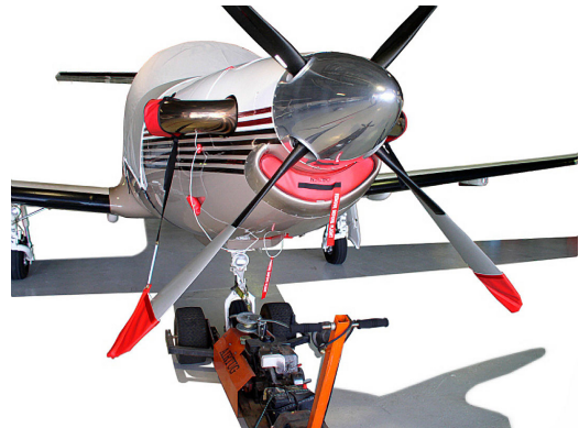
Pilatus PC-12 LARGE ENGINE INLET PLUG, SMALL PLUGS SET, Prop Tie/Exhaust Covers