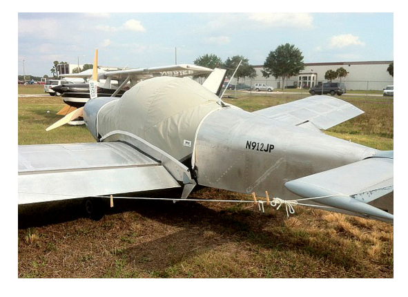
Zenith 601 XL Canopy Cover

This cover type is made from Silver Acrylic Sunbrella canvas and is 100% lined with a soft and smooth microfiber. Bruce's Custom Covers developed this material combination especially for aircraft protection. The outer material is medium weight and treated for water resistance, UV resistance and anti-static buildup. The inner lining is a very soft and smooth microfiber to prevent scratching. The material is very reflective, and tests show that the cabin interior temperature can be reduced to near-ambient temperature on the hottest of days. It is water, ice and snow repellent, yet breathable to allow moisture to escape from between the cover and the aircraft surface.