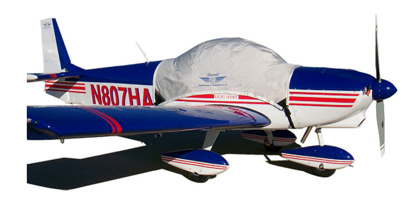
Alarus Canopy Cover