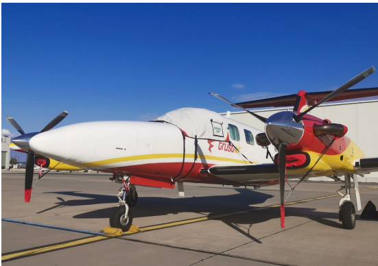
Piper PA-42 Cheyenne III Engine Plugs, Prop Ties, Cockpit Cover