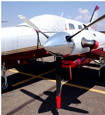
Piper Cheyenne Cockpit Cover, Engine Plugs, Prop Tie/Exhaust Covers

Travel Covers are made with Silver Solution-Dyed Polyester fabric and only lined over the windshield to save weight. The material is lightweight and more compact for easy stowage in the aircraft. The polyester material is water resistant, but only intended for occasional use outside. We also have an ultra lightweight material available for fitted hangar dust covers. For daily outdoor use, the non-travel Sunbrella Cover is the best choice.