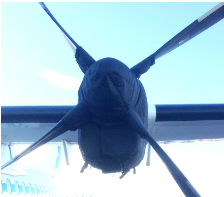
Piper PA-42 Cheyenne III Cockpit Cover, Prop Tie/Exhaust Cover, Inlet Plugs ATR-72-202 Insulated Engine & Prop Hub Covers