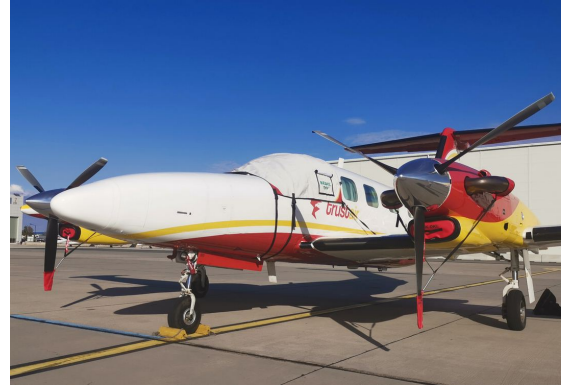
Piper Cheyenne IIXL Prop Tie/Exhaust Covers, Intake Plugs Piper PA-42 Cheyenne III Engine Plugs, Prop Ties, Cockpit Cover