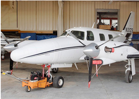
Piper Cheyenne IIXL Prop Tie/Exhaust Covers, Intake Plugs