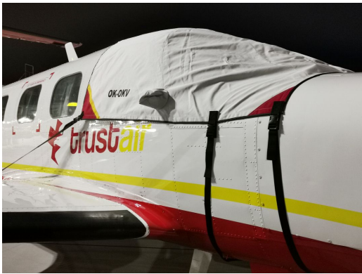
Piper PA-42 Cheyenne III Cockpit Cover

This cover type is made from Silver Acrylic Sunbrella canvas and is 100% lined with a soft and smooth microfiber. Bruce's Custom Covers developed this material combination especially for aircraft protection. The outer material is medium weight and treated for water resistance, UV resistance and anti-static buildup. The inner lining is a very soft and smooth microfiber to prevent scratching. The material is very reflective, and tests show that the cabin interior temperature can be reduced to near-ambient temperature on the hottest of days. It is water, ice and snow repellent, yet breathable to allow moisture to escape from between the cover and the aircraft surface.