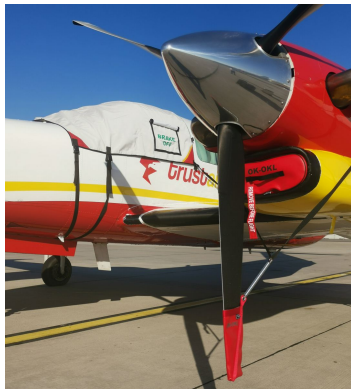
Piper PA-42 Cheyenne III Engine Plugs, Prop Ties, Cockpit Cover

This cover type is made from Silver Acrylic Sunbrella canvas and is 100% lined with a soft and smooth microfiber. Bruce's Custom Covers developed this material combination especially for aircraft protection. The outer material is medium weight and treated for water resistance, UV resistance and anti-static buildup. The inner lining is a very soft and smooth microfiber to prevent scratching. The material is very reflective, and tests show that the cabin interior temperature can be reduced to near-ambient temperature on the hottest of days. It is water, ice and snow repellent, yet breathable to allow moisture to escape from between the cover and the aircraft surface.