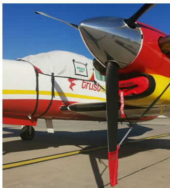
Piper PA-42 Cheyenne III Engine Plugs, Prop Ties, Cockpit Cover

Engine Inlet Plugs are custom fit for your Piper PA-42 Cheyenne III intakes, made with heavy-duty vinyl material, and stuffed with a single block of sculpted urethane foam. Each plug has a zipper that allows the foam to be removed and dried if necessary. Engine plugs have warning flags that are visible from the cockpit or 'remove before flight' streamers sewn onto the face of the plugs. Most plugs are imprinted with the aircraft registration number in black for an extra charge. Storage bag NOT included. Engine plugs may be inserted after flight when the engine is still warm. Engine Inlet Plugs are commonly referred to as Cowl Plugs, Intake Plugs, Cowl Blocks, Engine Blocks, and Engine Bungs.