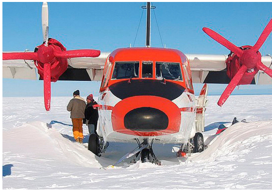
Casa 212 Insulated Engine & Propellor/Spinner Covers

This cover type is made from Silver Acrylic Sunbrella canvas and is 100% lined with a soft and smooth microfiber. Bruce's Custom Covers developed this material combination especially for aircraft protection. The outer material is medium weight and treated for water resistance, UV resistance and anti-static buildup. The inner lining is a very soft and smooth microfiber to prevent scratching. The material is very reflective, and tests show that the cabin interior temperature can be reduced to near-ambient temperature on the hottest of days. It is water, ice and snow repellent, yet breathable to allow moisture to escape from between the cover and the aircraft surface.