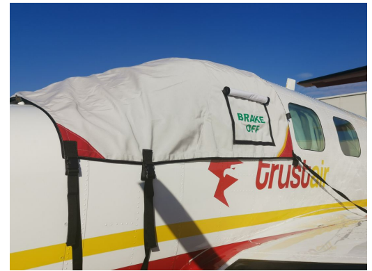
Piper PA-42 Cheyenne III Cockpit Cover