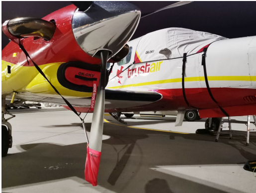
Piper PA-42 Cheyenne III Cockpit Cover, Prop Tie/Exhaust Cover, Inlet Plugs

Engine Inlet Plugs are custom fit for your Piper PA-42 Cheyenne III intakes, made with heavy-duty vinyl material, and stuffed with a single block of sculpted urethane foam. Each plug has a zipper that allows the foam to be removed and dried if necessary. Engine plugs have warning flags that are visible from the cockpit or 'remove before flight' streamers sewn onto the face of the plugs. Most plugs are imprinted with the aircraft registration number in black for an extra charge. Storage bag NOT included. Engine plugs may be inserted after flight when the engine is still warm. Engine Inlet Plugs are commonly referred to as Cowl Plugs, Intake Plugs, Cowl Blocks, Engine Blocks, and Engine Bungs.