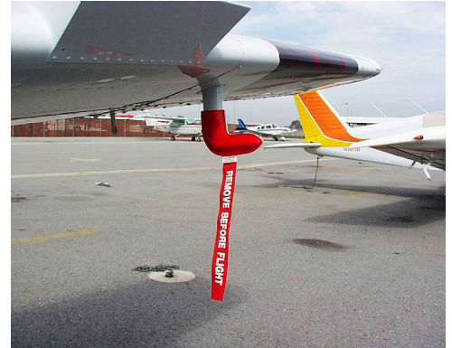
Piper PA-42 Cheyenne III Cockpit Cover, Prop Tie/Exhaust Cover, Inlet Plugs