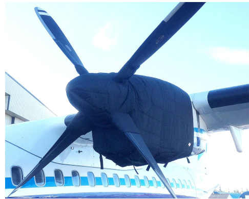
ATR-72-202 Insulated Engine & Prop Hub Covers