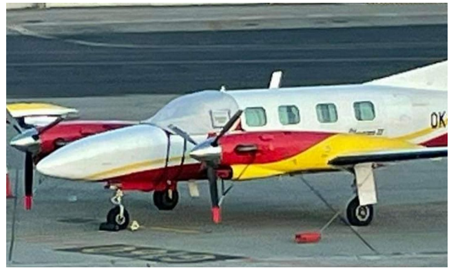
Piper PA-42 Cheyenne III Cockpit Cover