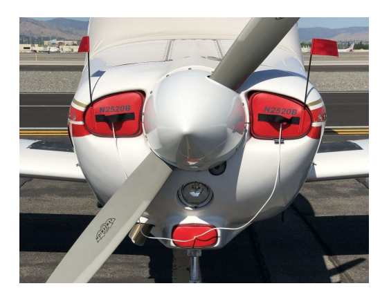
Piper Tomahawk Engine Inlet Plugs, set of 3