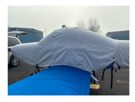
Piper PA-38 Tomahawk Extended Canopy/Engine Cover