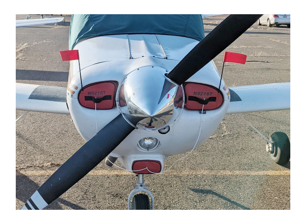
Piper PA-38 Tomahawk Engine Plugs