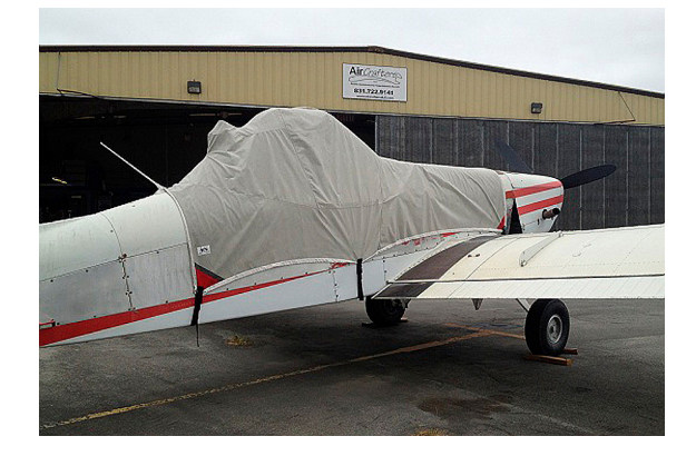
Piper Brave PA-36 Canopy/Hopper Cover

Travel Covers are made with Silver Solution-Dyed Polyester fabric and only lined over the windshield to save weight. The material is lightweight and more compact for easy stowage in the aircraft. The polyester material is water resistant, but only intended for occasional use outside. We also have an ultra lightweight material available for fitted hangar dust covers. For daily outdoor use, the non-travel Sunbrella Cover is the best choice.