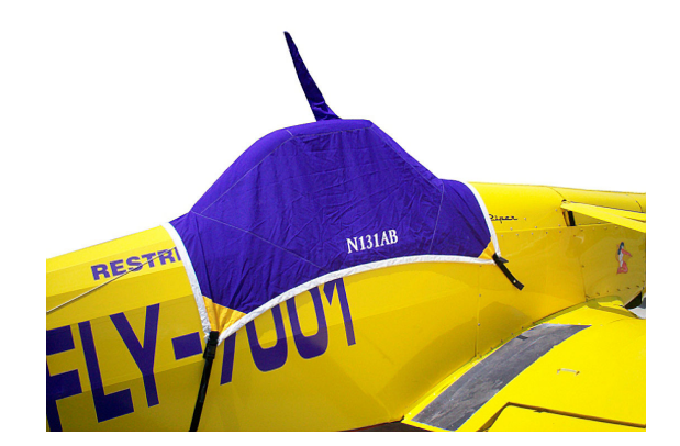
Piper Pawnee Canopy Cover