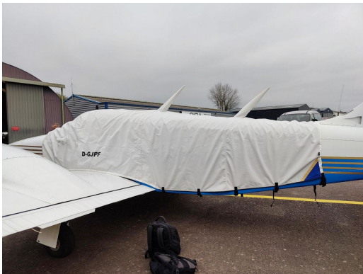
Piper PA-34 Seneca Extra Extended Canopy Cover

water resistance, UV resistance and anti-static buildup. The inner lining is a very soft and smooth microfiber to prevent scratching. The material is very reflective, and tests show that the cabin interior temperature can be reduced to near-ambient temperature on the hottest of days. It is water, ice and snow repellent, yet breathable to allow moisture to escape from between the cover and the aircraft surface.