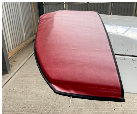
Piper PA-34 Seneca Wingtip Pads

Designed to prevent damage to the aircraft extremities in crowded hangars, these products are made of bright red Naugahyde and thickly padded with a sandwich of closed cell foam.