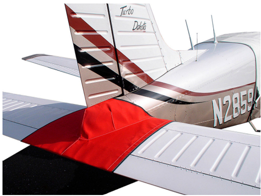
Piper PA-28 Tailcone Cover

WINTER USE MATERIAL - Made with Solution-Dyed Polyester fabric, this option is intended for seasonal use to aid in deicing, rain mitigation, or for occasional travel. The material is lighter and more compact, but more susceptible to UV damage and may have a shorter useful life if used continuously outside than the all-year use material.