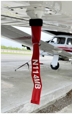
Blade-type Pitot Cover