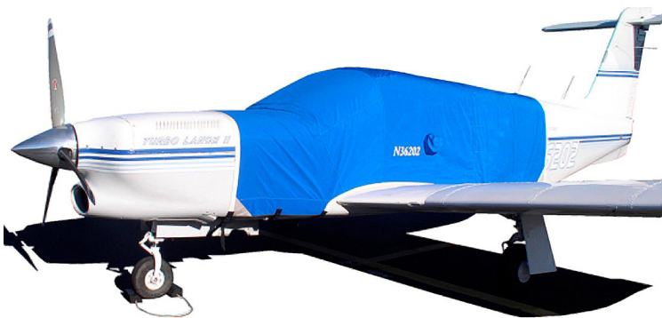
Piper PA-32 Models Extended Canopy Cover