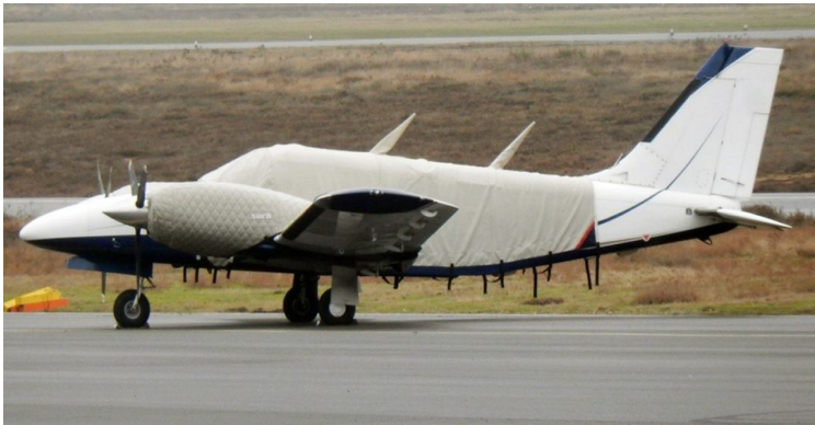
Piper Seneca Insulated Engine Covers

This cover type is made from Silver Acrylic Sunbrella canvas and is 100% lined with a soft and smooth microfiber. Bruce's Custom Covers developed this material combination especially for aircraft protection. The outer material is medium weight and treated for water resistance, UV resistance and anti-static buildup. The inner lining is a very soft and smooth microfiber to prevent scratching. The material is very reflective, and tests show that the cabin interior temperature can be reduced to near-ambient temperature on the hottest of days. It is water, ice and snow repellent, yet breathable to allow moisture to escape from between the cover and the aircraft surface.