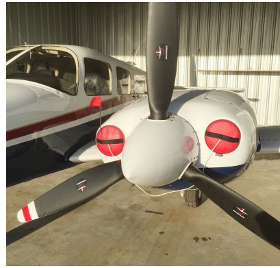
Piper PA-34 Seneca Engine Inlet Plugs (Lopresti Cowling)