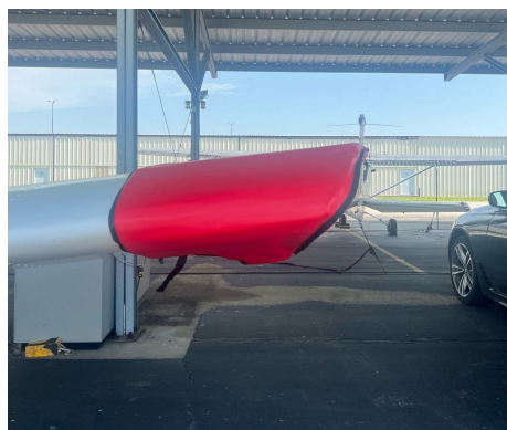
Piper PA-28-140 Wingtip Pads