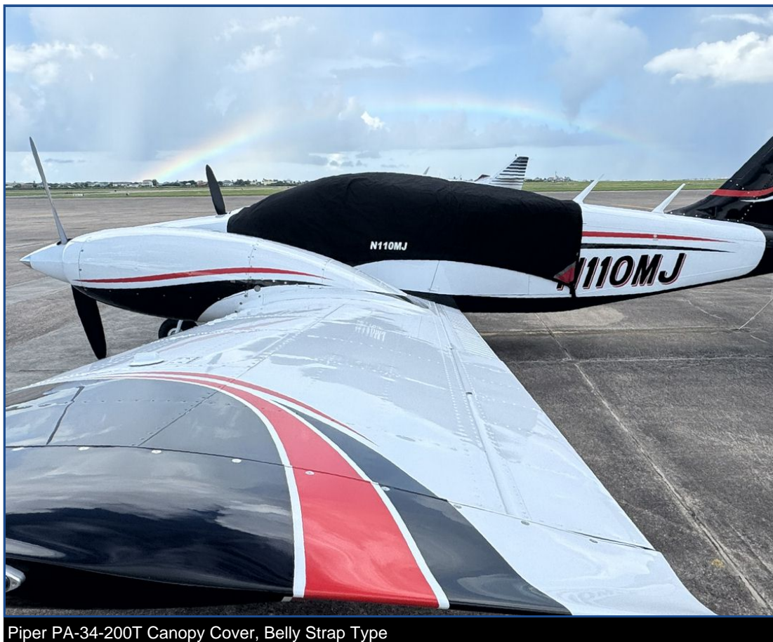
Piper PA-34-200T Canopy Cover, Belly Strap Type