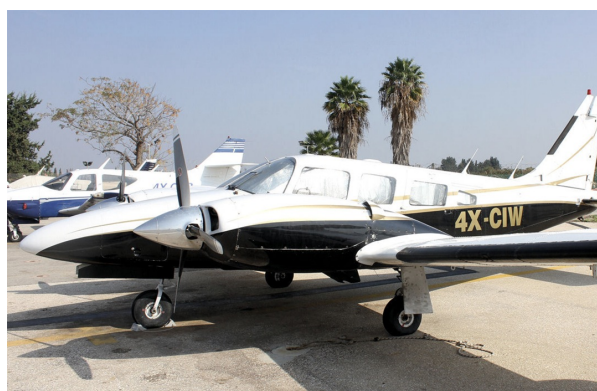
Piper Seneca Windshield & Cabin HeatShields

Windshield Heatshields are interior sunshades for an aircraft's front windshield. The product is a unique composite of closed-cell foam with a silver mylar finish. The semi-rigid design is stiff enough to stand along the inside of the windshield using sun visors or window framing. It folds up flat and easily stores in the included storage sleeve. Some designs may require velcro and suction cups or split right and left sides. A Heatshield is an excellent short-term remedy for cockpit overheating. An external fabric cover is far more effective and practical for long-term protection.