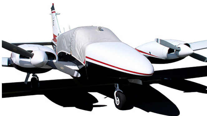
Piper Seneca Canopy Cover