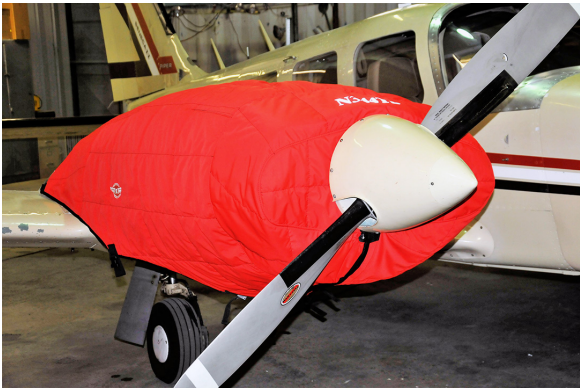
Piper Seneca Insulated Engine Covers