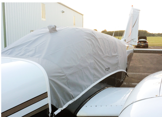
Piper PA-34 Seneca Travel Cover