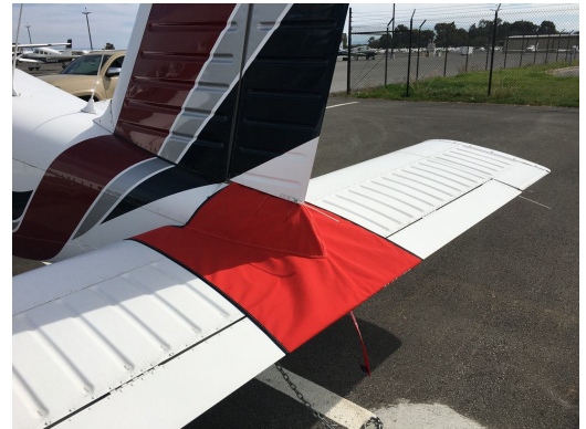
Piper PA-32 Models Tailcone Cover, Fully Enclosed