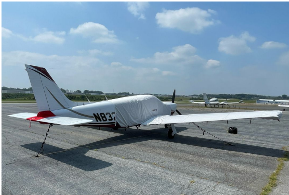
Piper PA-32R-301 Extended Canopy Cover, Wing & Tailcone Covers