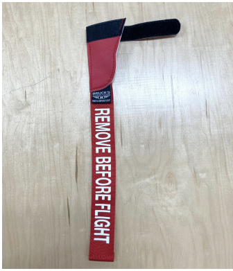
Piper Style Pitot Tube Cover, with Velcro Strap