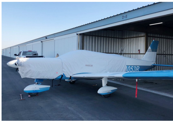
Piper PA-32 Extended Canopy Cover & Engine Cover