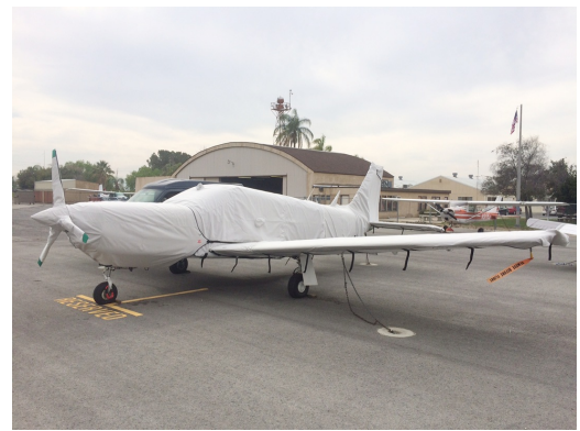
Piper PA-32 Full Cover Set