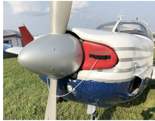
Piper PA-32 Engine Plugs