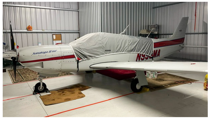
Piper PA-32 Saratoga, Cherokee 6, Lance Travel Cover, Light Weight Canopy Cover