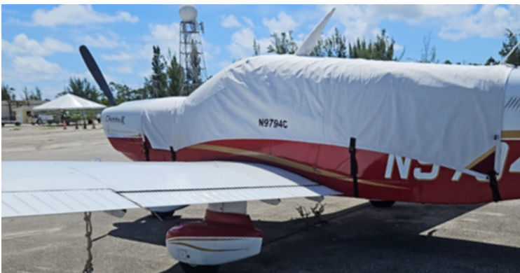
PA32-260 Extended Canopy/Engine & Wing Covers Piper PA-32 Saratoga Canopy Cover W/fwd Bib To Cover Baggage Door