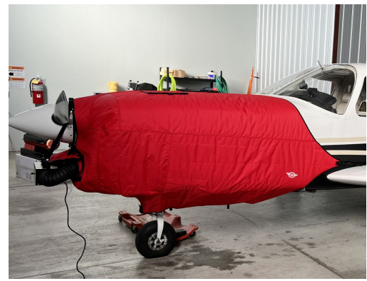
Piper PA-32RT-300T Insulated Engine Cover