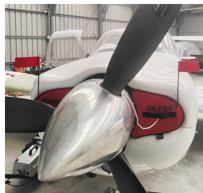
Piper PA-32 Engine Plugs