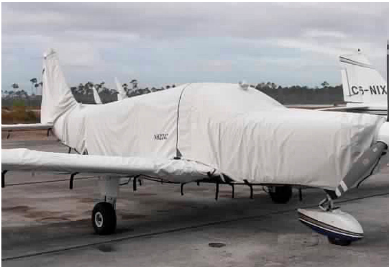
Piper PA-32 Full Cover set

WINTER USE MATERIAL - Made with Solution-Dyed Polyester fabric, this option is intended for seasonal use to aid in deicing, rain mitigation, or for occasional travel. The material is lighter and more compact, but more susceptible to UV damage and may have a shorter useful life if used continuously outside than the all-year use material.