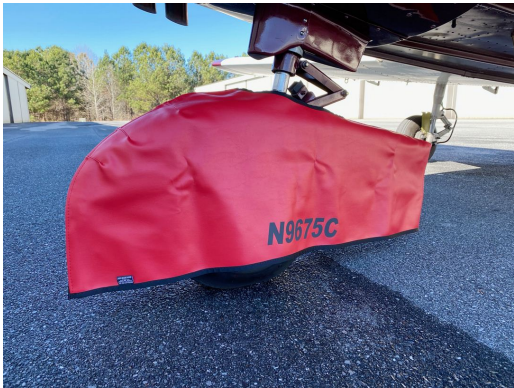
Piper PA-32 Saratoga Front Wheelpant Cover

ALL-YEAR USE MATERIAL - Made with Silver Acrylic Sunbrella canvas, the all-year use material is the best option for sun protection and cover longevity. This heavier more durable material is intended for all weather conditions, such as rain and snow or lots of sun.