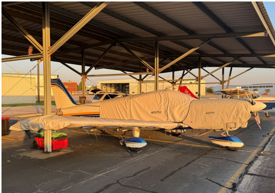
Piper PA-32-260 Extended Canopy, Engine & Wing Covers