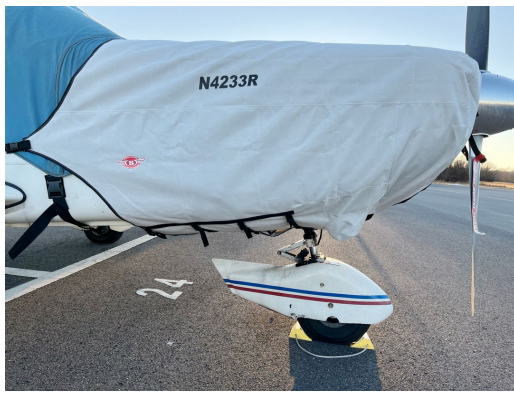
Piper PA-32-300 Fully Enclosed Engine Cover