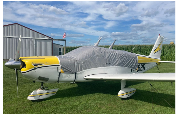
Piper PA-32-301T Travel Weight Canopy Cover, w/fwd bib.