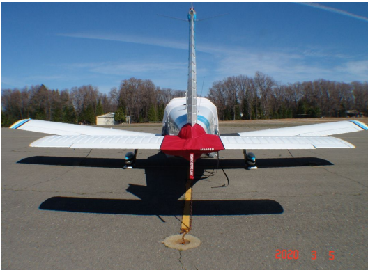
Piper PA32-300 Tailcone Cover, fully enclosed

WINTER USE MATERIAL - Made with Solution-Dyed Polyester fabric, this option is intended for seasonal use to aid in deicing, rain mitigation, or for occasional travel. The material is lighter and more compact, but more susceptible to UV damage and may have a shorter useful life if used continuously outside than the all-year use material.