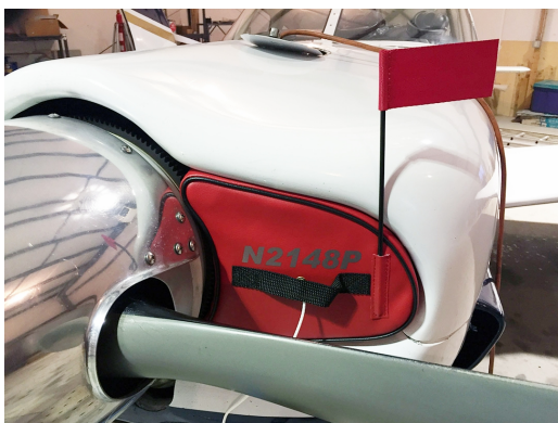
Piper PA-32 Saratoga/Cherokee 6 Engine Inlet Plugs