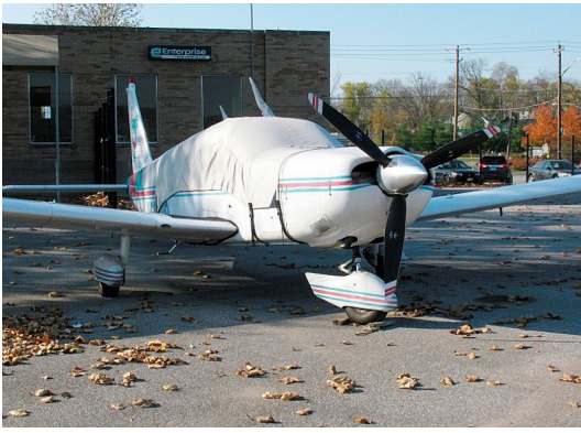
Piper PA-32-300 Canopy Cover w/baggage area extension