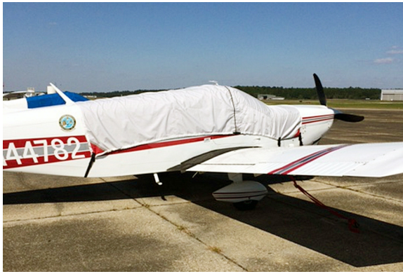
Piper PA-32 Saratoga/Cherokee 6 Canopy Cover