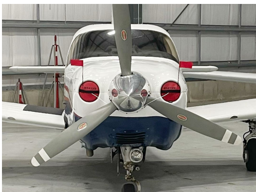
Piper PA-32R-301T Saratoga Engine Inlet Plugs