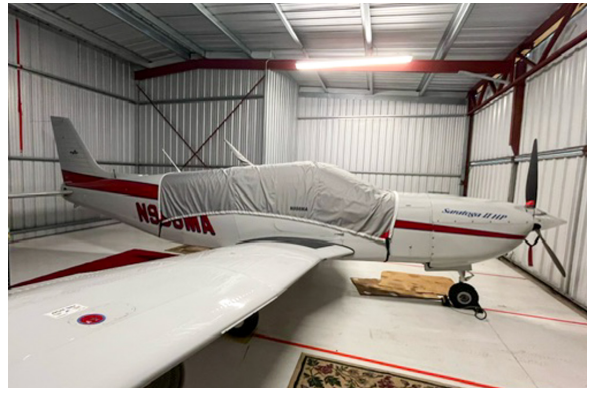
Piper PA-32 Saratoga, Cherokee 6, Lance Travel Cover, Light Weight Canopy Cover