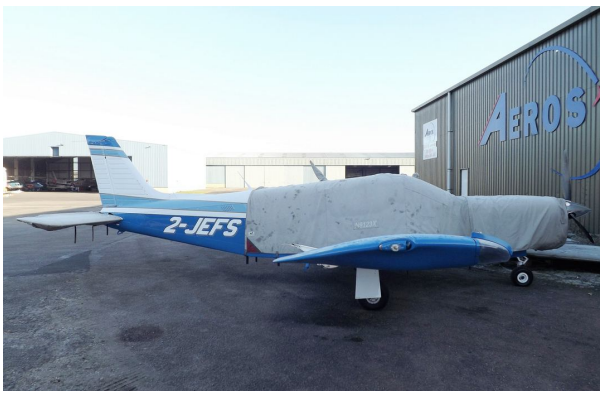
Piper PA-32R-301T Extended Canopy, Engine, Horiz. Stabilizer Covers