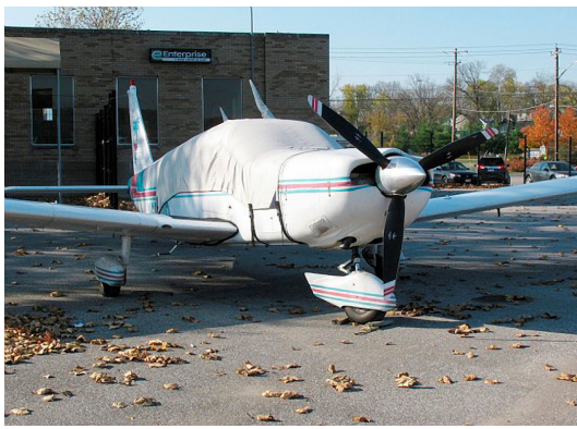
Piper PA-32-300 Canopy Cover w/baggage area extension