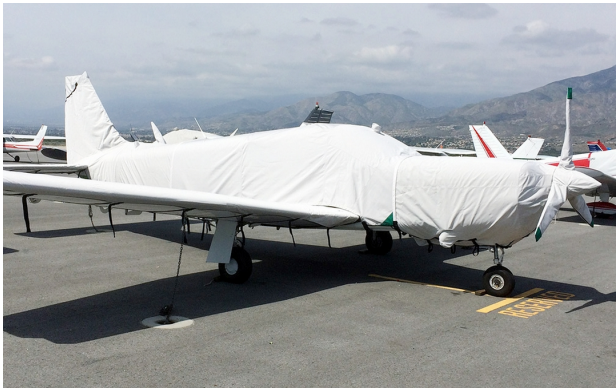
Piper PA-32 Saratoga/Cherokee 6 Empennage, Engine, Prop, Wing, and Extended Canopy Cover

WINTER USE MATERIAL - Made with Solution-Dyed Polyester fabric, this option is intended for seasonal use to aid in deicing, rain mitigation, or for occasional travel. The material is lighter and more compact, but more susceptible to UV damage and may have a shorter useful life if used continuously outside than the all-year use material.