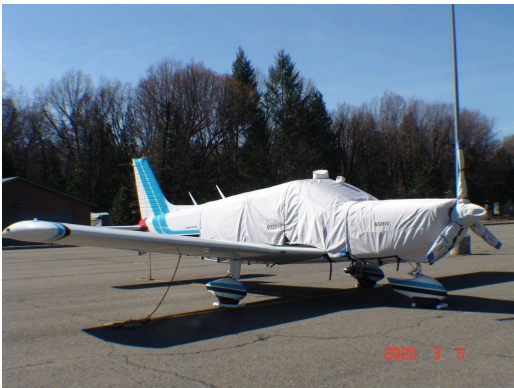
Piper PA-32-300 Extended Canopy, Engine, Prop & Tailcone Covers