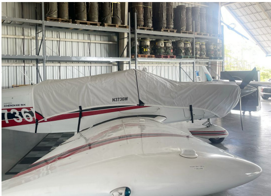
Piper Cherokee Six Canopy/Engine Cover

This cover type is made from Silver Acrylic Sunbrella canvas and is 100% lined with a soft and smooth microfiber. Bruce's Custom Covers developed this material combination especially for aircraft protection. The outer material is medium weight and treated for water resistance, UV resistance and anti-static buildup. The inner lining is a very soft and smooth microfiber to prevent scratching. The material is very reflective, and tests show that the cabin interior temperature can be reduced to near-ambient temperature on the hottest of days. It is water, ice and snow repellent, yet breathable to allow moisture to escape from between the cover and the aircraft surface.