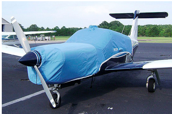
Piper PA-32 Lance Canopy/Engine Cover

This cover type is made from Silver Acrylic Sunbrella canvas and is 100% lined with a soft and smooth microfiber. Bruce's Custom Covers developed this material combination especially for aircraft protection. The outer material is medium weight and treated for water resistance, UV resistance and anti-static buildup. The inner lining is a very soft and smooth microfiber to prevent scratching. The material is very reflective, and tests show that the cabin interior temperature can be reduced to near-ambient temperature on the hottest of days. It is water, ice and snow repellent, yet breathable to allow moisture to escape from between the cover and the aircraft surface.