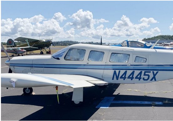
Piper PA32-300 HeatShield Set