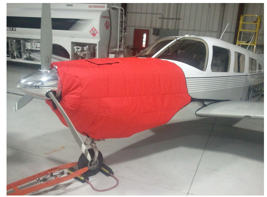
Piper PA-32 Insulated Engine Cover