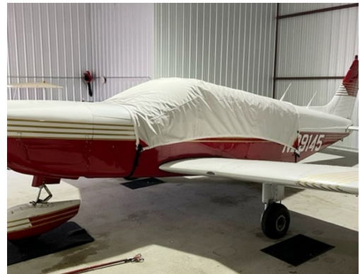
Piper PA-32-300 Canopy Cover