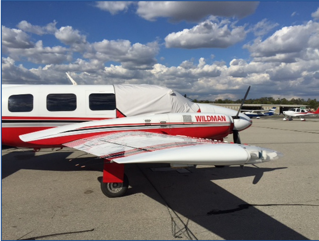
Piper Navajo Cockpit Cover, extended to cover emerg. door.