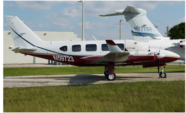
Piper Navajo Cockpit Cover, Engine Plugs