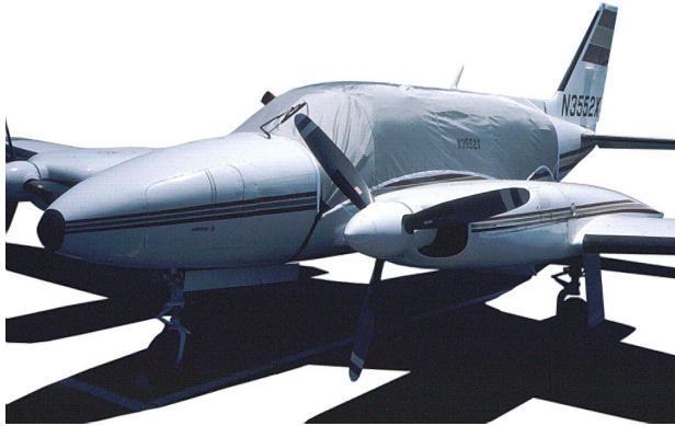
Piper Navajo Canopy Cover

This cover type is made from Silver Acrylic Sunbrella canvas and is 100% lined with a soft and smooth microfiber. Bruce's Custom Covers developed this material combination especially for aircraft protection. The outer material is medium weight and treated for water resistance, UV resistance and anti-static buildup. The inner lining is a very soft and smooth microfiber to prevent scratching. The material is very reflective, and tests show that the cabin interior temperature can be reduced to near-ambient temperature on the hottest of days. It is water, ice and snow repellent, yet breathable to allow moisture to escape from between the cover and the aircraft surface.