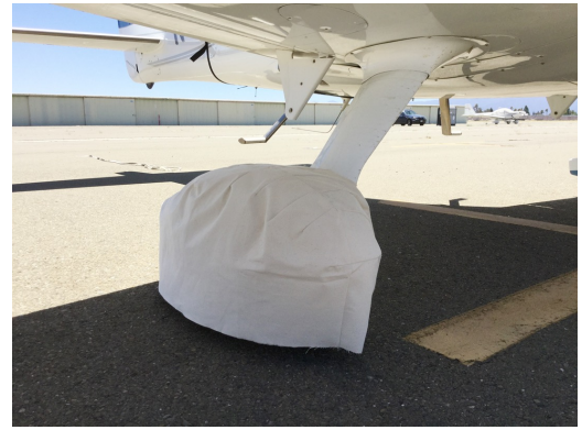
Cirrus Main Gear Wheelpant Cover