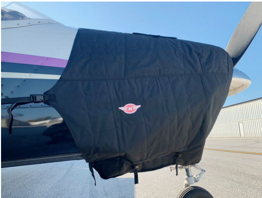
Piper PA-28-236 Extended Canopy Cover, Insulated Engine Cover, Tailcone Cover Piper PA-28R-200 Insulated Engine Cover