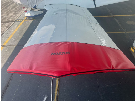
Piper PA-28-140 Wingtip Pads

Designed to prevent damage to the aircraft extremities in crowded hangars, these products are made of bright red Naugahyde and thickly padded with a sandwich of closed cell foam.