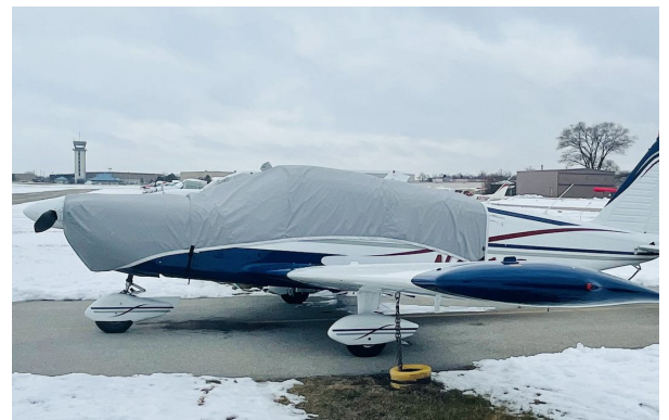
Piper PA-32-260 Travel Canopy/Engine Cover