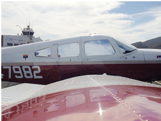
Piper PA-28 HeatShield Set

Windshield Heatshields are interior sunshades for an aircraft's front windshield. The product is a unique composite of closed-cell foam with a silver mylar finish. The semi-rigid design is stiff enough to stand along the inside of the windshield using sun visors or window framing. It folds up flat and easily stores in the included storage sleeve. Some designs may require velcro and suction cups or split right and left sides. A Heatshield is an excellent short-term remedy for cockpit overheating. An external fabric cover is far more effective and practical for long-term protection.