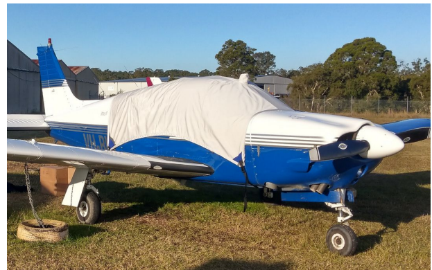
Piper PA-28 Canopy Cover