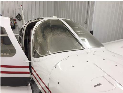
Piper PA-28 Models Windshield Heatshield