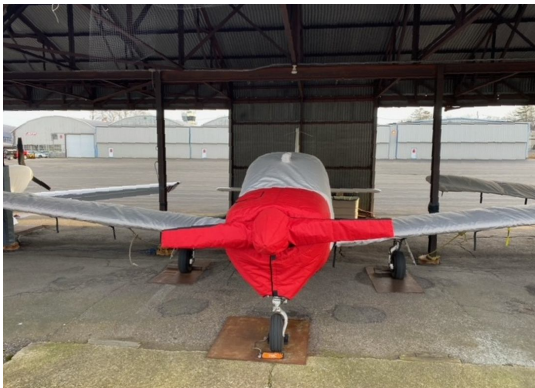
Piper PA-28 Insulated Propellor/Spinner Cover 2 Blade

WINTER USE MATERIAL - Made with Solution-Dyed Polyester fabric, this option is intended for seasonal use to aid in deicing, rain mitigation, or for occasional travel. The material is lighter and more compact, but more susceptible to UV damage and may have a shorter useful life if used continuously outside than the all-year use material.