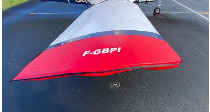
Piper PA-28RT-201T Wingtip Pads