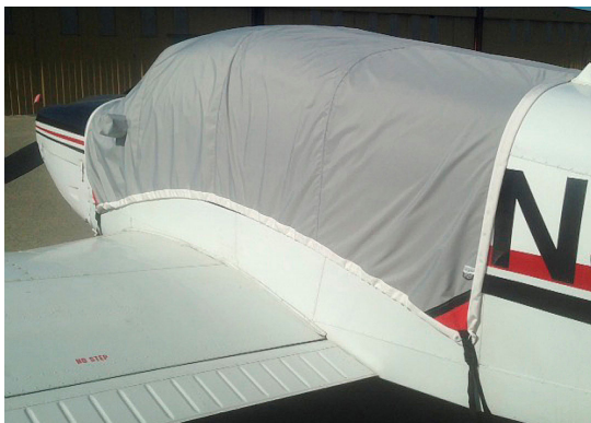
Piper PA-28 Lightweight Travel Cover (~70% lighter than Sunbrella!)

Travel Covers are made with Silver Solution-Dyed Polyester fabric and only lined over the windshield to save weight. The material is lightweight and more compact for easy stowage in the aircraft. The polyester material is water resistant, but only intended for occasional use outside. We also have an ultra lightweight material available for fitted hangar dust covers. For daily outdoor use, the non-travel Sunbrella Cover is the best choice.