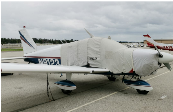
Piper PA-28 Extended Canopy Cover, Engine Cover