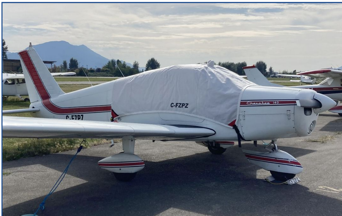
Piper PA-28-140 Canopy Cover, Snap/Belly Strap Type