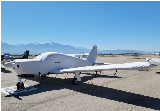
Piper PA28R-201 Complete Cover Set

This cover type is made from Silver Acrylic Sunbrella canvas and is 100% lined with a soft and smooth microfiber. Bruce's Custom Covers developed this material combination especially for aircraft protection. The outer material is medium weight and treated for water resistance, UV resistance and anti-static buildup. The inner lining is a very soft and smooth microfiber to prevent scratching. The material is very reflective, and tests show that the cabin interior temperature can be reduced to near-ambient temperature on the hottest of days. It is water, ice and snow repellent, yet breathable to allow moisture to escape from between the cover and the aircraft surface.