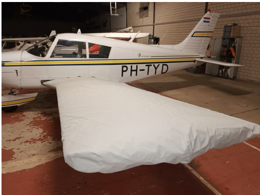
Piper PA28-140 Wing Covers