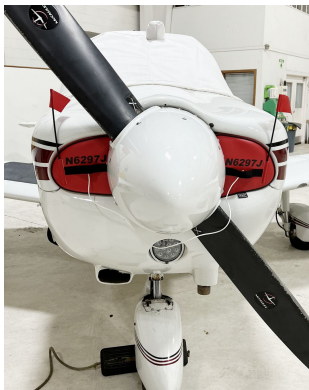
Piper PA-28-181 Engine Inlet Plugs

Engine Inlet Plugs are custom fit for your Piper PA-28 Models intakes, made with heavy-duty vinyl material, and stuffed with a single block of sculpted urethane foam. Each plug has a zipper that allows the foam to be removed and dried if necessary. Engine plugs have warning flags that are visible from the cockpit or 'remove before flight' streamers sewn onto the face of the plugs. Most plugs are imprinted with the aircraft registration number in black for an extra charge. Storage bag NOT included. Engine plugs may be inserted after flight when the engine is still warm. Engine Inlet Plugs are commonly referred to as Cowl Plugs, Intake Plugs, Cowl Blocks, Engine Blocks, and Engine Bungs.