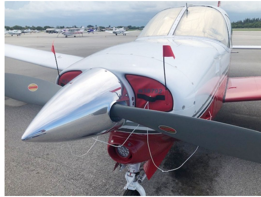
Piper PA-28 Arrow IV Engine Plugs, Windshield HeatShield