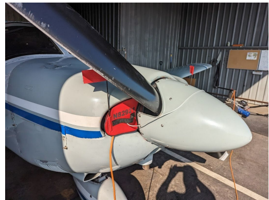
Piper PA-28-181 Engine Inlet Plugs