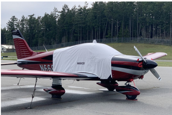
Piper PA-28-181 Extended Canopy Cover

This cover type is made from Silver Acrylic Sunbrella canvas and is 100% lined with a soft and smooth microfiber. Bruce's Custom Covers developed this material combination especially for aircraft protection. The outer material is medium weight and treated for water resistance, UV resistance and anti-static buildup. The inner lining is a very soft and smooth microfiber to prevent scratching. The material is very reflective, and tests show that the cabin interior temperature can be reduced to near-ambient temperature on the hottest of days. It is water, ice and snow repellent, yet breathable to allow moisture to escape from between the cover and the aircraft surface.