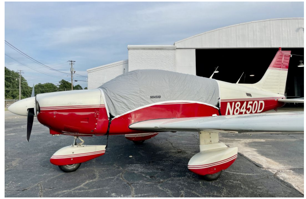
Piper PA-28 Travel cover