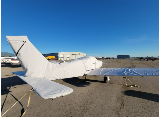
Piper PA28R-201 Complete Cover Set

WINTER USE MATERIAL - Made with Solution-Dyed Polyester fabric, this option is intended for seasonal use to aid in deicing, rain mitigation, or for occasional travel. The material is lighter and more compact, but more susceptible to UV damage and may have a shorter useful life if used continuously outside than the all-year use material.