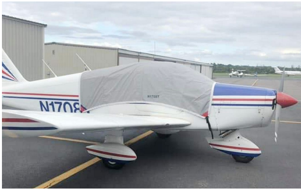
Piper PA-28-140 Travel Cover