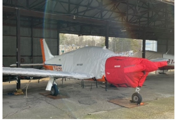
Piper PA-28 Extended Canopy Cover