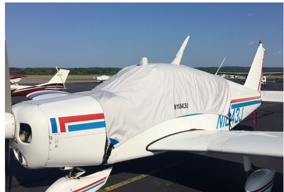
Piper PA-28-140 Canopy Cover with 12" forward extension