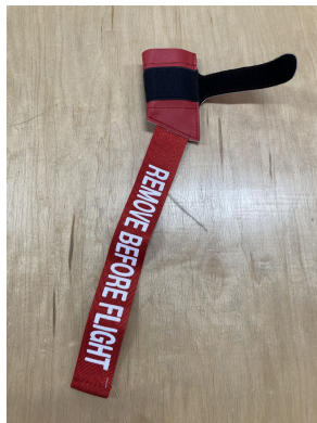
Piper PA-28 Models Pitot Cover, Blade Type, Non-Slip

Engine Inlet Plugs are custom fit for your Piper PA-28 Models intakes, made with heavy-duty vinyl material, and stuffed with a single block of sculpted urethane foam. Each plug has a zipper that allows the foam to be removed and dried if necessary. Engine plugs have warning flags that are visible from the cockpit or 'remove before flight' streamers sewn onto the face of the plugs. Most plugs are imprinted with the aircraft registration number in black for an extra charge. Storage bag NOT included. Engine plugs may be inserted after flight when the engine is still warm. Engine Inlet Plugs are commonly referred to as Cowl Plugs, Intake Plugs, Cowl Blocks, Engine Blocks, and Engine Bungs.