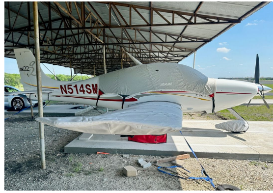
Cirrus SR-22 Canopy, Wing & Wheelpant Covers