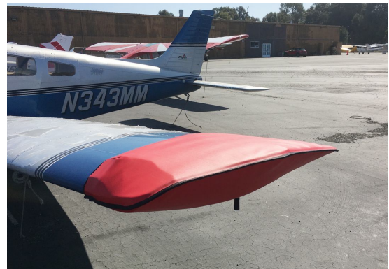
Piper PA-28-181 Wingtip Pads