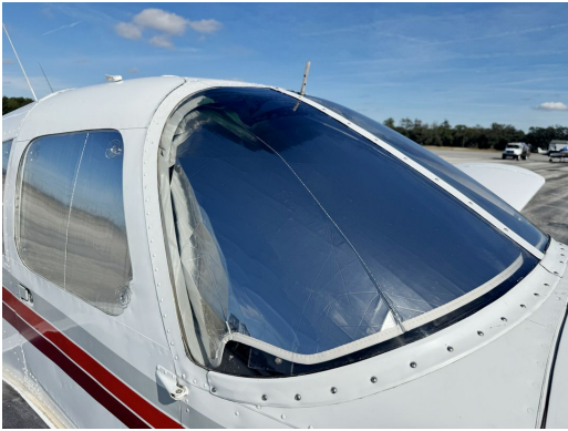
Piper PA-28-180 HeatShield Set

Windshield Heatshields are interior sunshades for an aircraft's front windshield. The product is a unique composite of closed-cell foam with a silver mylar finish. The semi-rigid design is stiff enough to stand along the inside of the windshield using sun visors or window framing. It folds up flat and easily stores in the included storage sleeve. Some designs may require velcro and suction cups or split right and left sides. A Heatshield is an excellent short-term remedy for cockpit overheating. An external fabric cover is far more effective and practical for long-term protection.