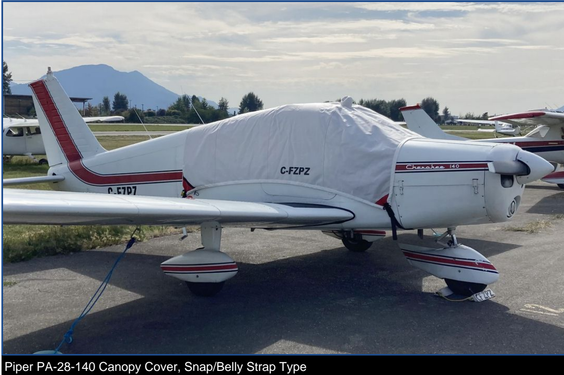
Piper PA-28-140 Canopy Cover, Snap/Belly Strap Type