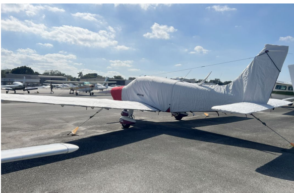
Piper PA-28-151 Complete Cover Set

This cover type is made from Silver Acrylic Sunbrella canvas and is 100% lined with a soft and smooth microfiber. Bruce's Custom Covers developed this material combination especially for aircraft protection. The outer material is medium weight and treated for water resistance, UV resistance and anti-static buildup. The inner lining is a very soft and smooth microfiber to prevent scratching. The material is very reflective, and tests show that the cabin interior temperature can be reduced to near-ambient temperature on the hottest of days. It is water, ice and snow repellent, yet breathable to allow moisture to escape from between the cover and the aircraft surface.