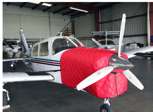
FOR INTERIOR USE. Piper PA-28 insulated Hangar Blanket, available in Red or Silver