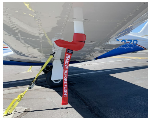
Piper PA-24-250 Pitot Cover