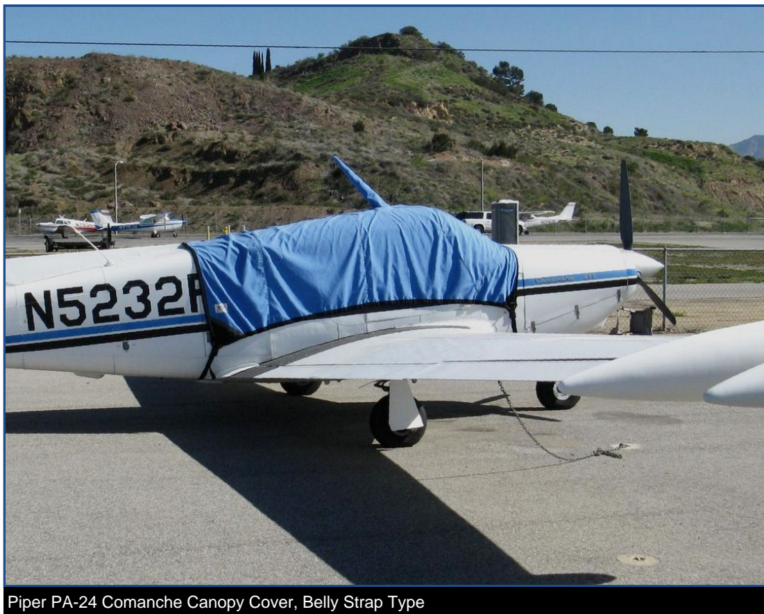
Piper PA-24 Comanche Canopy Cover, Belly Strap Type