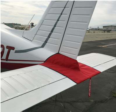
Piper PA-28-140 Tailcone Cover

WINTER USE MATERIAL - Made with Solution-Dyed Polyester fabric, this option is intended for seasonal use to aid in deicing, rain mitigation, or for occasional travel. The material is lighter and more compact, but more susceptible to UV damage and may have a shorter useful life if used continuously outside than the all-year use material.