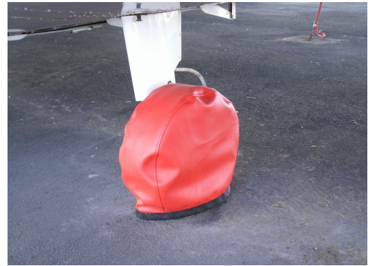
Piper PA28-140 Tire Covers