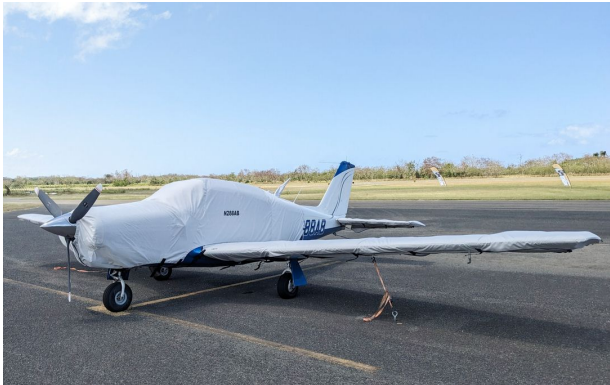
Piper PA-24 Comanche Extended Canopy/Engine Cover, Wing & Horizontal Stab Covers