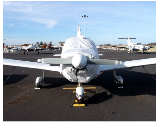
Piper PA-28 Extended Canopy Cover and Engine Cover