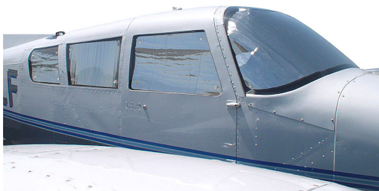
Piper Comanche HeatShield Set

Windshield Heatshields are interior sunshades for an aircraft's front windshield. The product is a unique composite of closed-cell foam with a silver mylar finish. The semi-rigid design is stiff enough to stand along the inside of the windshield using sun visors or window framing. It folds up flat and easily stores in the included storage sleeve. Some designs may require velcro and suction cups or split right and left sides. A Heatshield is an excellent short-term remedy for cockpit overheating. An external fabric cover is far more effective and practical for long-term protection.