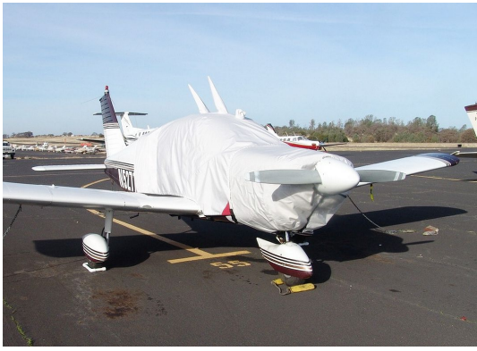
Piper PA-28 Extended Canopy Cover and Engine Cover