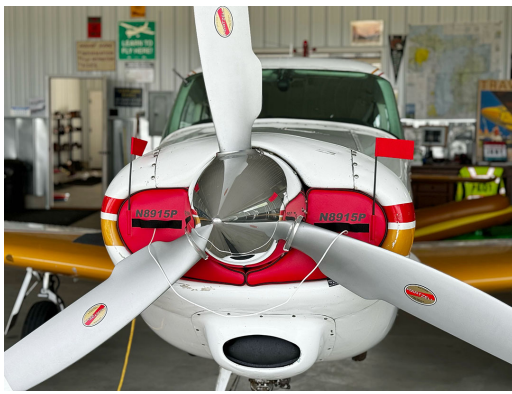
Piper PA-24-260 Engine Inlet Plugs