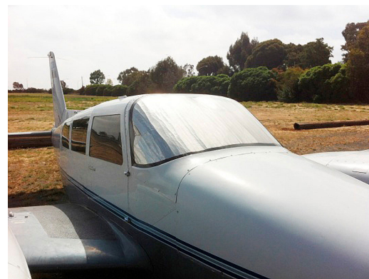
Piper Comanche Windshield HeatShield