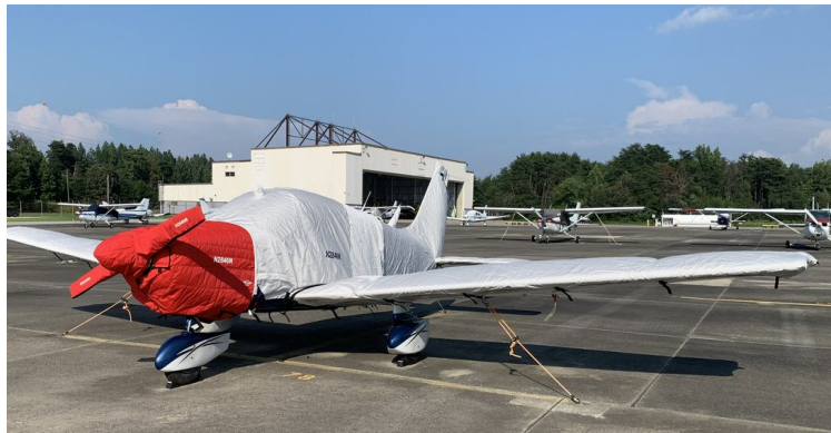
Piper PA-28 Full Winter Cover Set

This cover type is made from Silver Acrylic Sunbrella canvas and is 100% lined with a soft and smooth microfiber. Bruce's Custom Covers developed this material combination especially for aircraft protection. The outer material is medium weight and treated for water resistance, UV resistance and anti-static buildup. The inner lining is a very soft and smooth microfiber to prevent scratching. The material is very reflective, and tests show that the cabin interior temperature can be reduced to near-ambient temperature on the hottest of days. It is water, ice and snow repellent, yet breathable to allow moisture to escape from between the cover and the aircraft surface.