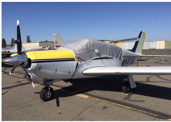
Piper PA-24 Comanche Travel Cover, Light Weight Travel Canopy Cover