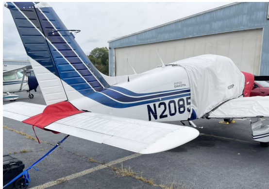
Piper PA-28-236 Extended Canopy Cover, Insulated Engine Cover, Tailcone Cover