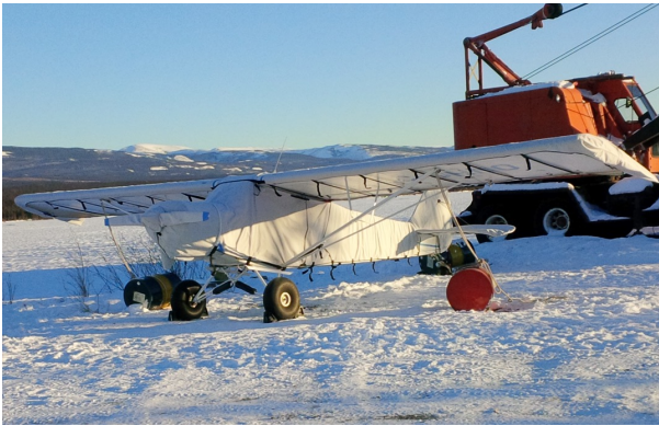
Piper Super Cub Complete Cover Set

WINTER USE MATERIAL - Made with Solution-Dyed Polyester fabric, this option is intended for seasonal use to aid in deicing, rain mitigation, or for occasional travel. The material is lighter and more compact, but more susceptible to UV damage and may have a shorter useful life if used continuously outside than the all-year use material.