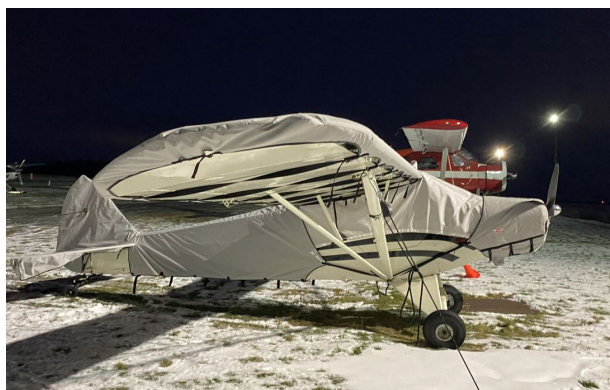
PA-18 Super Cub Winter Cover Set

This cover type is made from Silver Acrylic Sunbrella canvas and is 100% lined with a soft and smooth microfiber. Bruce's Custom Covers developed this material combination especially for aircraft protection. The outer material is medium weight and treated for water resistance, UV resistance and anti-static buildup. The inner lining is a very soft and smooth microfiber to prevent scratching. The material is very reflective, and tests show that the cabin interior temperature can be reduced to near-ambient temperature on the hottest of days. It is water, ice and snow repellent, yet breathable to allow moisture to escape from between the cover and the aircraft surface.