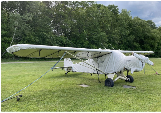
Piper Super Cub Complete Cover Set