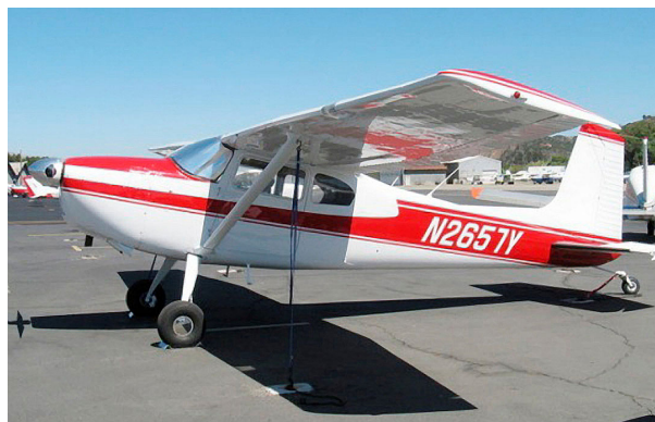
Cessna 180 & 185 Windshield HeatShield

Windshield Heatshields are interior sunshades for an aircraft's front windshield. The product is a unique composite of closed-cell foam with a silver mylar finish. The semi-rigid design is stiff enough to stand along the inside of the windshield using sun visors or window framing. It folds up flat and easily stores in the included storage sleeve. Some designs may require velcro and suction cups or split right and left sides. A Heatshield is an excellent short-term remedy for cockpit overheating. An external fabric cover is far more effective and practical for long-term protection.