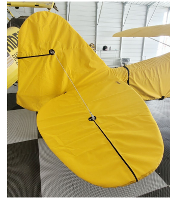
Piper PA-18 Empennage Cover