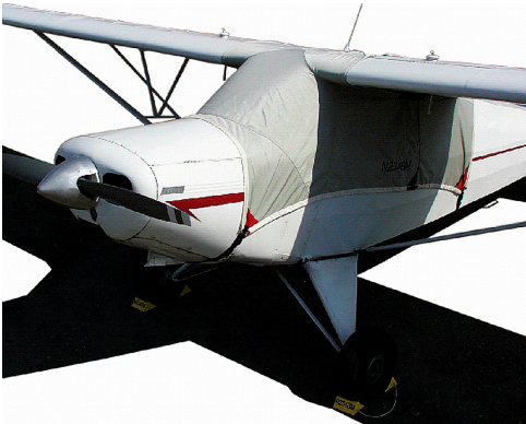
Sportsman 2+2 Wag Aero Light Weight Over the Top Travel Canopy Cover Piper PA-12 Super Cruiser Over-Top Canopy Cover