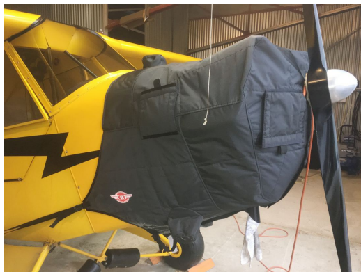
Piper J3 Cub Insulated Engine Cover

This cover type is made from Silver Acrylic Sunbrella canvas and is 100% lined with a soft and smooth microfiber. Bruce's Custom Covers developed this material combination especially for aircraft protection. The outer material is medium weight and treated for water resistance, UV resistance and anti-static buildup. The inner lining is a very soft and smooth microfiber to prevent scratching. The material is very reflective, and tests show that the cabin interior temperature can be reduced to near-ambient temperature on the hottest of days. It is water, ice and snow repellent, yet breathable to allow moisture to escape from between the cover and the aircraft surface.