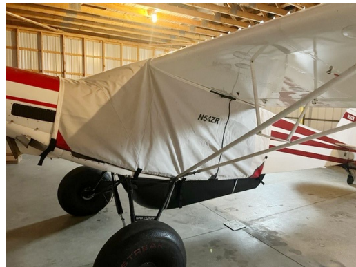
Piper PA-11 Extended Canopy Cover, Over the Top Style