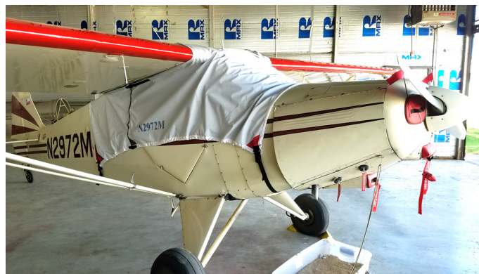
Piper PA-12 Wrap-Around Canopy Cover, Engine Plugs

Engine Inlet Plugs are custom fit for your Piper PA-12: Super Cruiser, J5 Cub intakes, made with heavy-duty vinyl material, and stuffed with a single block of sculpted urethane foam. Each plug has a zipper that allows the foam to be removed and dried if necessary. Engine plugs have warning flags that are visible from the cockpit or 'remove before flight' streamers sewn onto the face of the plugs. Most plugs are imprinted with the aircraft registration number in black for an extra charge. Storage bag NOT included. Engine plugs may be inserted after flight when the engine is still warm. Engine Inlet Plugs are commonly referred to as Cowl Plugs, Intake Plugs, Cowl Blocks, Engine Blocks, and Engine Bungs.