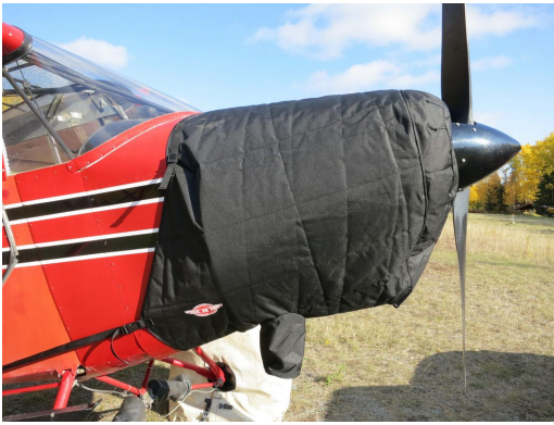
Piper PA-12 Insulated Engine Cover