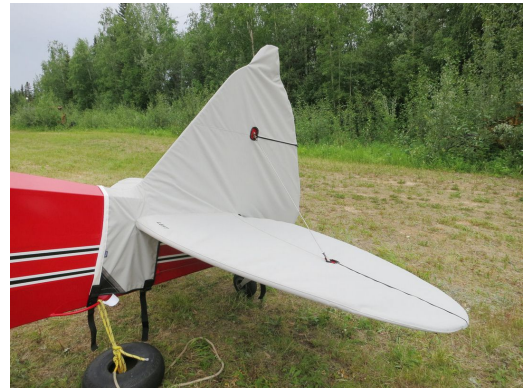
Piper PA-12 Abbreviated Empennage Cover