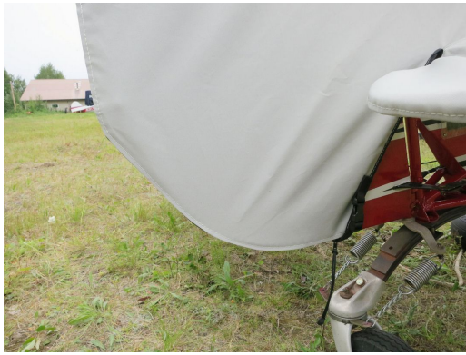
Piper PA-12 Abbreviated Empennage Cover