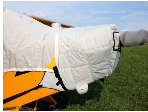
Piper J-3 Cub Insulated Engine Cover with added Pre-heater Access Flaps