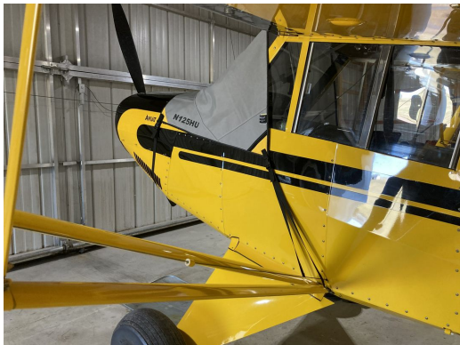
Aviat Husky Windshield/Skylight Cover

the hottest of days. It is water, ice and snow repellent, yet breathable to allow moisture to escape from between the cover and the aircraft surface.