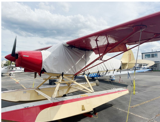
Piper PA-12 Extended Canopy Cover, Extends to Tail

This cover type is made from Silver Acrylic Sunbrella canvas and is 100% lined with a soft and smooth microfiber. Bruce's Custom Covers developed this material combination especially for aircraft protection. The outer material is medium weight and treated for water resistance, UV resistance and anti-static buildup. The inner lining is a very soft and smooth microfiber to prevent scratching. The material is very reflective, and tests show that the cabin interior temperature can be reduced to near-ambient temperature on the hottest of days. It is water, ice and snow repellent, yet breathable to allow moisture to escape from between the cover and the aircraft surface.