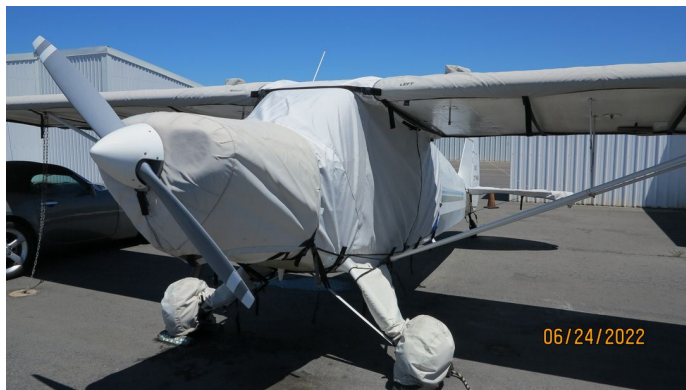
Piper PA-12 Over-Top Canopy Cover, Engine, Wing & Landing Gear Covers

slightly and attaches under the horizontal stabilizers with adjustable straps. Tailcone Covers are normally made with Solution-Dyed Polyester or Acrylic Sunbrella .