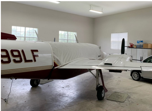
Piper Aerostar PA-60-700P Canopy Cover Windows Only