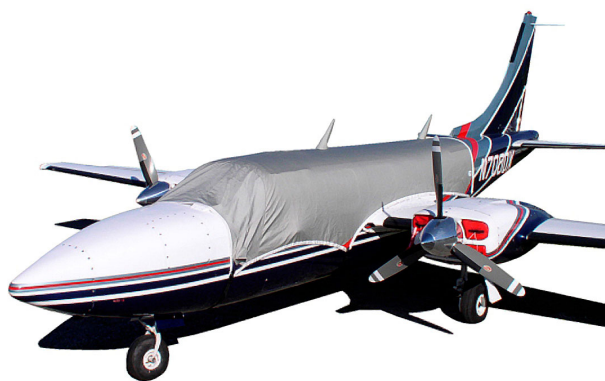
Aerostar Canopy Cover & Plugs

Travel Covers are made with Silver Solution-Dyed Polyester fabric and only lined over the windshield to save weight. The material is lightweight and more compact for easy stowage in the aircraft. The polyester material is water resistant, but only intended for occasional use outside. We also have an ultra lightweight material available for fitted hangar dust covers. For daily outdoor use, the non-travel Sunbrella Cover is the best choice.