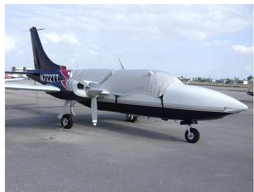
Aerostar Canopy Cover