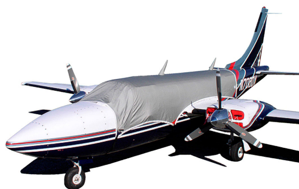
Aerostar Canopy Cover & Plugs