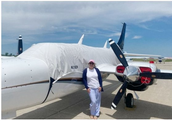
Piper PA-601 Aerostar