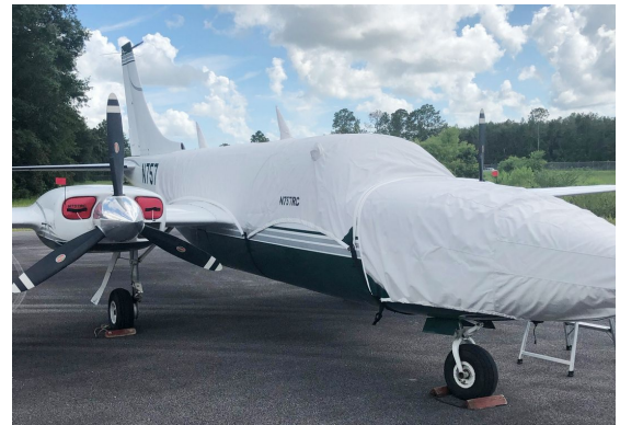
Piper Aerostar Canopy & Nose Covers, Engine Plugs