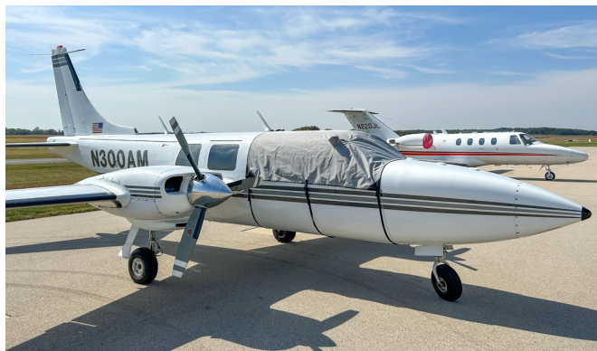
AEROSTAR 601P Travel Cover, Light Weight Travel Cockpit/Skylights Cover