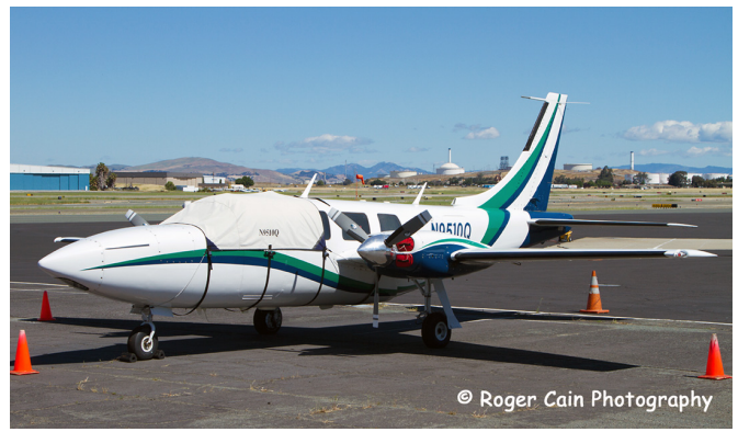
Piper Aerostar Cockpit Cover and Engine Inlet Plugs