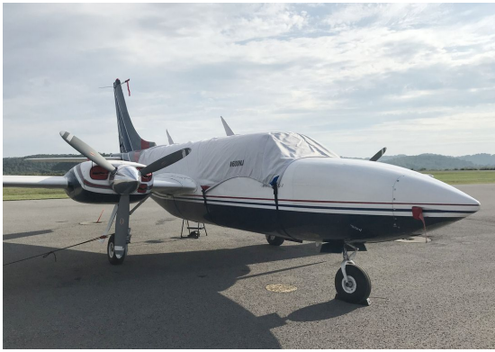
Smith Aerostar 600 Canopy Cover