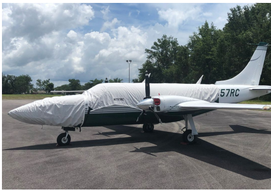
Piper Aerostar Canopy & Nose Covers, Engine Plugs