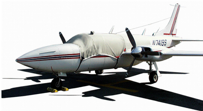
Aerostar Canopy Cover

The Piper PA-601 Aerostar Nose Cover is designed to cover the section of the fuselage forward of the windshield to the tip of the nose. It is secured with belly straps. This cover type is made from Silver Acrylic Sunbrella canvas and is 100% lined with a soft and smooth microfiber. Bruce's Custom Covers developed this material combination especially for aircraft protection. The outer material is medium weight and treated for water resistance, UV resistance and anti-static buildup. The inner lining is a very soft and smooth microfiber to prevent scratching. The material is very reflective, and tests show that the cabin interior temperature can be reduced to near-ambient temperature on the hottest of days. It is water, ice and snow repellent, yet breathable to allow moisture to escape from between the cover and the aircraft surface.