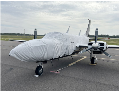
Piper PA-601 Aerostar Fuselage Cover (back to Horiz Stab)