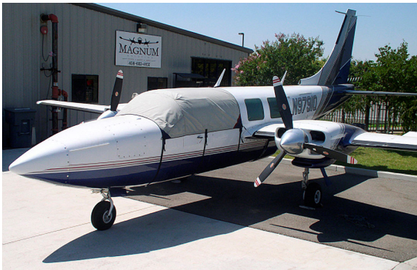
Aerostar Windshield/Cockpit Cover

The Piper PA-601 Aerostar Nose Cover is designed to cover the section of the fuselage forward of the windshield to the tip of the nose. It is secured with belly strapsThis cover type is made from Silver Acrylic Sunbrella canvas and is 100% lined with a soft and smooth microfiber. Bruce's Custom Covers developed this material combination especially for aircraft protection. The outer material is medium weight and treated for water resistance, UV resistance and anti-static buildup. The inner lining is a very soft and smooth microfiber to prevent scratching. The material is very reflective, and tests show that the cabin interior temperature can be reduced to near-ambient temperature on the hottest of days. It is water, ice and snow repellent, yet breathable to allow moisture to escape from between the cover and the aircraft surface.