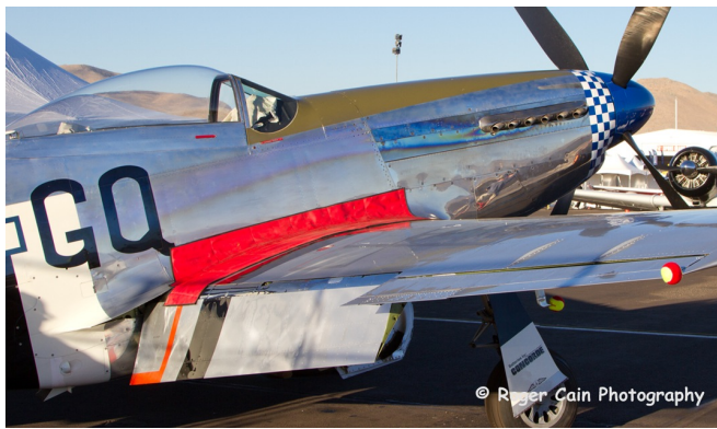
North American P-51 Wing Walk Pad