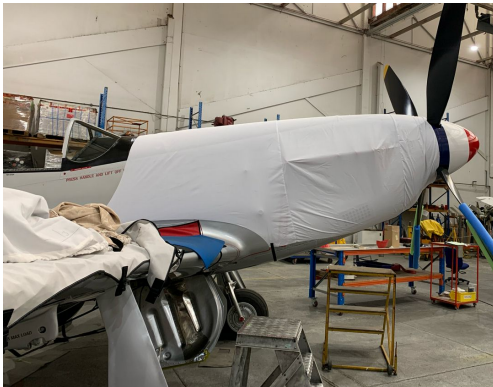
North American P51 Engine Cover, test fit cover

This cover type is made from Silver Acrylic Sunbrella canvas and is 100% lined with a soft and smooth microfiber. Bruce's Custom Covers developed this material combination especially for aircraft protection. The outer material is medium weight and treated for water resistance, UV resistance and anti-static buildup. The inner lining is a very soft and smooth microfiber to prevent scratching. The material is very reflective, and tests show that the cabin interior temperature can be reduced to near-ambient temperature on the hottest of days. It is water, ice and snow repellent, yet breathable to allow moisture to escape from between the cover and the aircraft surface.