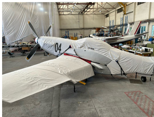
North American Mustang P51 Engine Cover