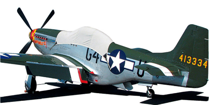
North American P51 Canopy Cover & Exhaust Plugs