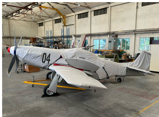
North American Mustang P51 Engine Cover

WINTER USE MATERIAL - Made with Solution-Dyed Polyester fabric, this option is intended for seasonal use to aid in deicing, rain mitigation, or for occasional travel. The material is lighter and more compact, but more susceptible to UV damage and may have a shorter useful life if used continuously outside than the all-year use material.