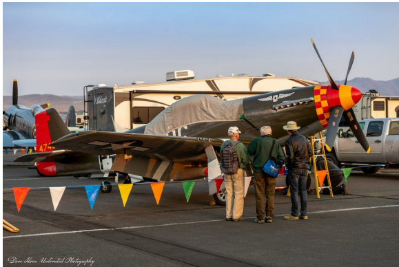
North American P-51 Canopy Cover