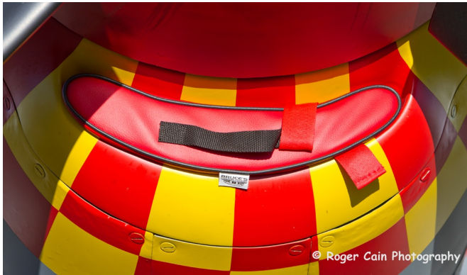
North American P-51 Chin Scoop Plug

Engine Inlet Plugs are custom fit for your North American Mustang P51 intakes, made with heavy-duty vinyl material, and stuffed with a single block of sculpted urethane foam. Each plug has a zipper that allows the foam to be removed and dried if necessary. Engine plugs have warning flags that are visible from the cockpit or 'remove before flight' streamers sewn onto the face of the plugs. Most plugs are imprinted with the aircraft registration number in black for an extra charge. Storage bag NOT included. Engine plugs may be inserted after flight when the engine is still warm. Engine Inlet Plugs are commonly referred to as Cowl Plugs, Intake Plugs, Cowl Blocks, Engine Blocks, and Engine Bungs.