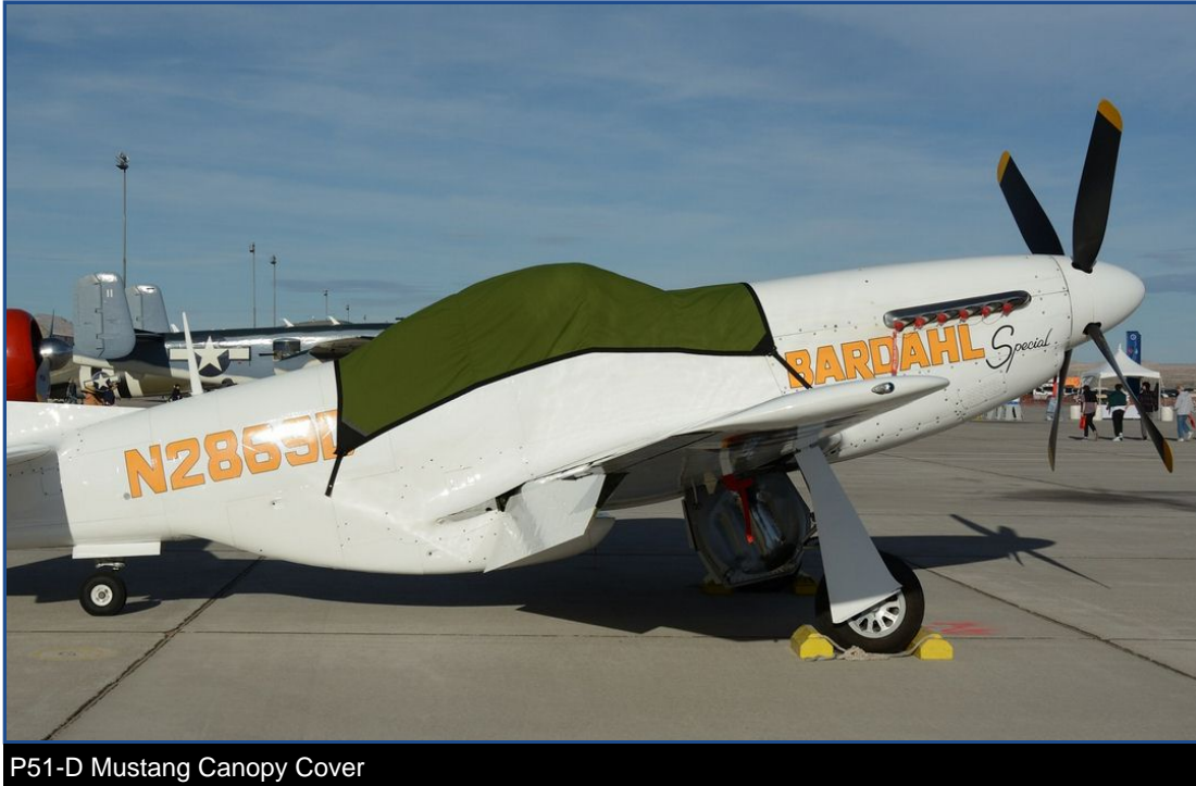
P51-D Mustang Canopy Cover