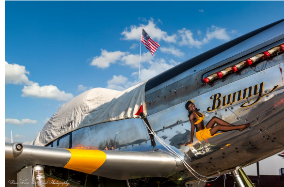
North American P-51 Canopy Cover