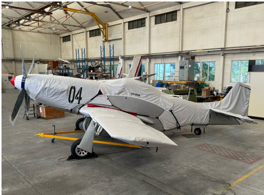
North American Mustang P51 Engine Cover

WINTER USE MATERIAL - Made with Solution-Dyed Polyester fabric, this option is intended for seasonal use to aid in deicing, rain mitigation, or for occasional travel. The material is lighter and more compact, but more susceptible to UV damage and may have a shorter useful life if used continuously outside than the all-year use material.