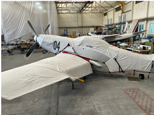
North American Mustang P51 Engine Cover