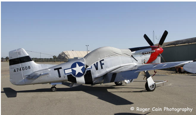
North American P-51 Canopy Cover

Travel Covers are made with Silver Solution-Dyed Polyester fabric and only lined over the windshield to save weight. The material is lightweight and more compact for easy stowage in the aircraft. The polyester material is water resistant, but only intended for occasional use outside. We also have an ultra lightweight material available for fitted hangar dust covers. For daily outdoor use, the non-travel Sunbrella Cover is the best choice.