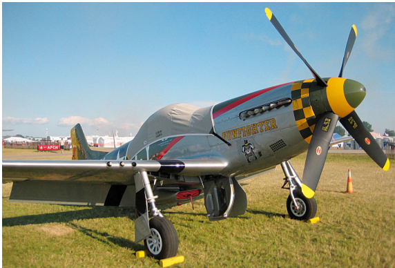
North American P51 Canopy Cover & Belly Scoop Plug

Engine Inlet Plugs are custom fit for your North American Mustang P51 intakes, made with heavy-duty vinyl material, and stuffed with a single block of sculpted urethane foam. Each plug has a zipper that allows the foam to be removed and dried if necessary. Engine plugs have warning flags that are visible from the cockpit or 'remove before flight' streamers sewn onto the face of the plugs. Most plugs are imprinted with the aircraft registration number in black for an extra charge. Storage bag NOT included. Engine plugs may be inserted after flight when the engine is still warm. Engine Inlet Plugs are commonly referred to as Cowl Plugs, Intake Plugs, Cowl Blocks, Engine Blocks, and Engine Bungs.