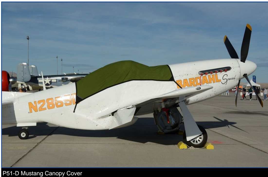
P51-D Mustang Canopy Cover