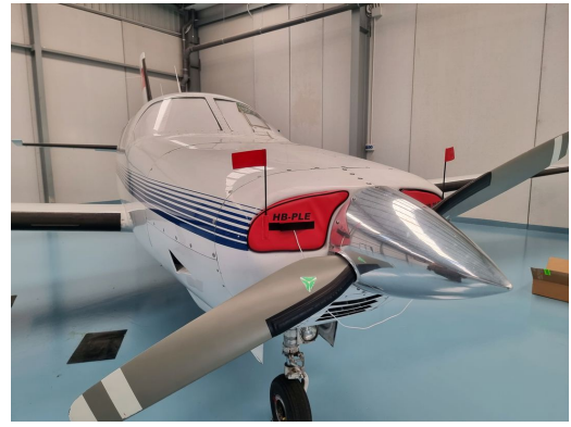
Piper PA-46 Malibu Engine Inlet Plugs