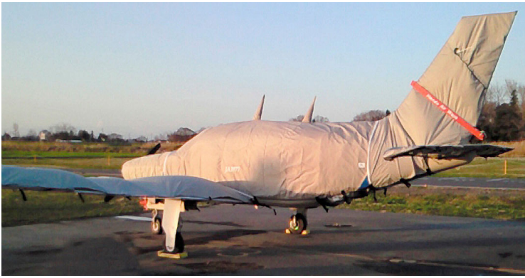
Piper PA-46 Malibu Complete Cover Set