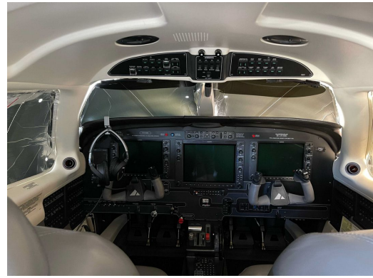
Piper Meridian Cockpit Sunshades