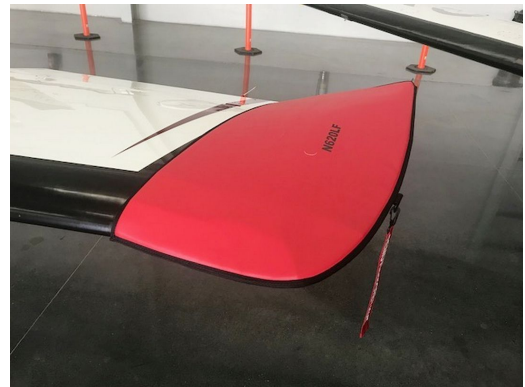
Piper Meridian Wingtip Pads, M600 Models