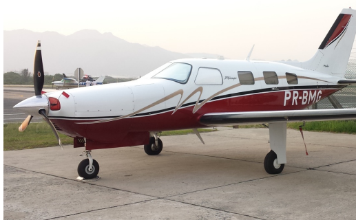
Piper Malibu/Mirage Engine Plugs, Cockpit HeatShields

Engine Inlet Plugs are custom fit for your Piper PA-46-500TP, 600TP Meridian, M500, M600, M700 intakes, made with heavy-duty vinyl material, and stuffed with a single block of sculpted urethane foam. Each plug has a zipper that allows the foam to be removed and dried if necessary. Engine plugs have warning flags that are visible from the cockpit or 'remove before flight' streamers sewn onto the face of the plugs. Most plugs are imprinted with the aircraft registration number in black for an extra charge. Storage bag NOT included. Engine plugs may be inserted after flight when the engine is still warm. Engine Inlet Plugs are commonly referred to as Cowl Plugs, Intake Plugs, Cowl Blocks, Engine Blocks, and Engine Bungs.