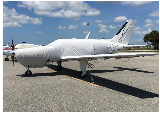
Piper Malibu Extended Canopy Cover, Engine, Wing & Horiz. Stab. Covers