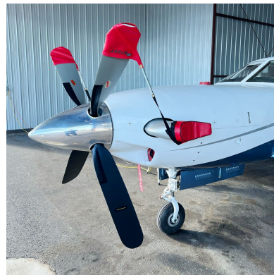
Piper Meridian Prop Tie/Exhaust Cover Set, 4-Blade, Heat Resistant Type