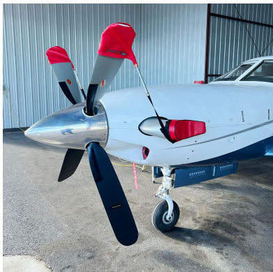
Fairchild Metro 5 Blade Insulated Insulated Prop Covers Piper Meridian Prop Tie/Exhaust Cover Set, 4-Blade, Heat Resistant Type