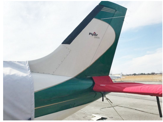
Piper Malibu/Mirage Horizontal Stabilizer/Tailcone Cover