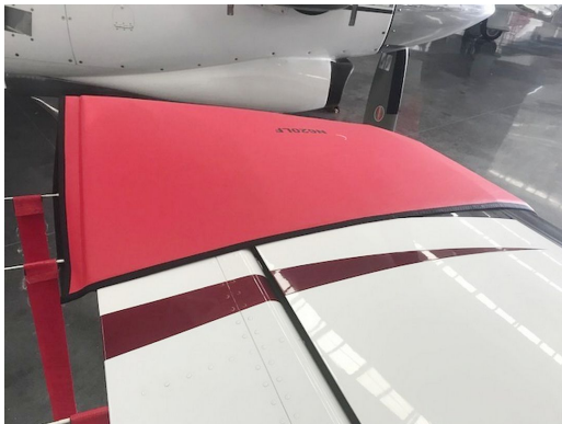
Piper Meridian Wingtip Pads, M600 Models

Designed to prevent damage to the aircraft extremities in crowded hangars, these products are made of bright red Naugahyde and thickly padded with a sandwich of closed cell foam.