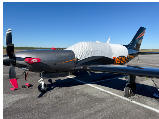
PA-46-600TP Canopy Cover