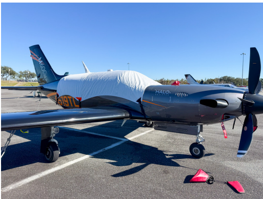
PA-46-600TP Canopy Cover