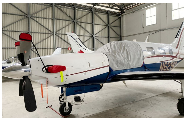
Piper PA-46-500TP Engine Cowling Top Plug