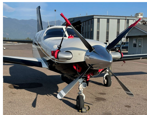
Piper Meridian Prop Tie/Exhaust Cover, Plug Set