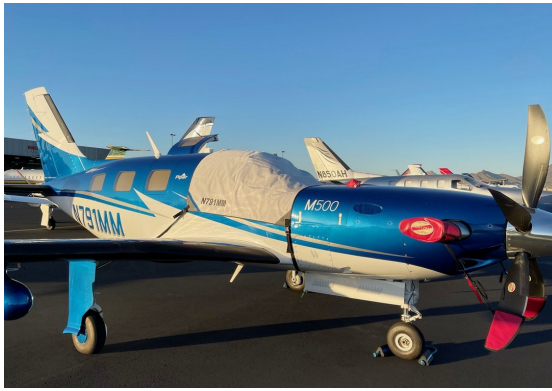
Piper M500 Cockpit Cover