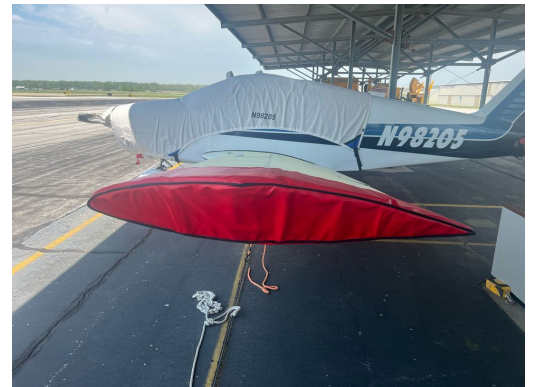
Piper PA-28-140 Wingtip Pads