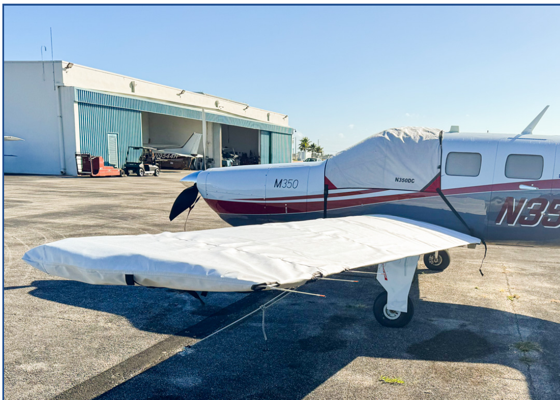
Piper PA 46-350P Cockpit &amp; Wing Covers