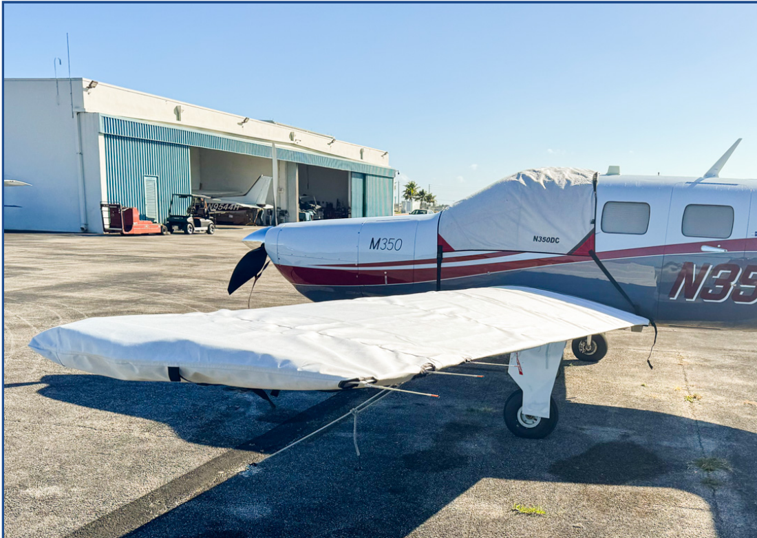
Piper PA 46-350P Cockpit &amp; Wing Covers