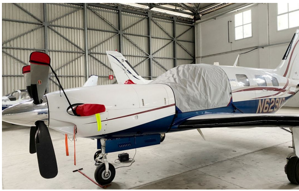
Piper PA-46-500TP Engine Cowling Top Plug