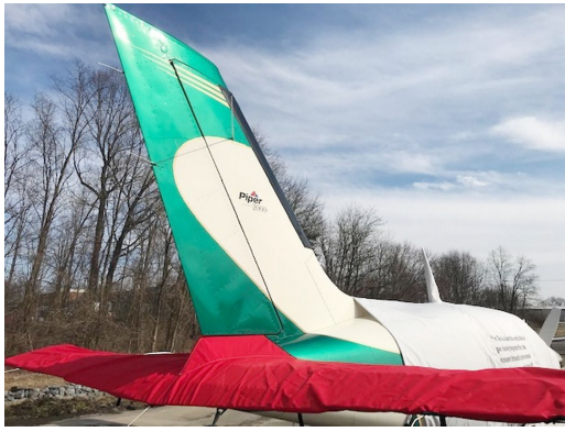
Piper Malibu/Mirage Horizontal Stabilizer/Tailcone Cover