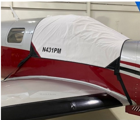
Piper Meridian Cockpit Cover

This cover type is made from Silver Acrylic Sunbrella canvas and is 100% lined with a soft and smooth microfiber. Bruce's Custom Covers developed this material combination especially for aircraft protection. The outer material is medium weight and treated for water resistance, UV resistance and anti-static buildup. The inner lining is a very soft and smooth microfiber to prevent scratching. The material is very reflective, and tests show that the cabin interior temperature can be reduced to near-ambient temperature on the hottest of days. It is water, ice and snow repellent, yet breathable to allow moisture to escape from between the cover and the aircraft surface.