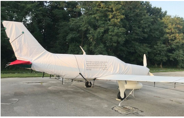
Piper Malibu, Mirage, Meridian Extended Canopy, Engine, Empennage & Wing Covers.