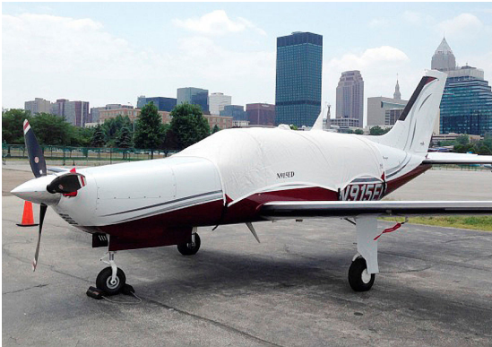
Piper Mirage Canopy Cover, Engine Plugs

Travel Covers are made with Silver Solution-Dyed Polyester fabric and only lined over the windshield to save weight. The material is lightweight and more compact for easy stowage in the aircraft. The polyester material is water resistant, but only intended for occasional use outside. We also have an ultra lightweight material available for fitted hangar dust covers. For daily outdoor use, the non-travel Sunbrella Cover is the best choice.