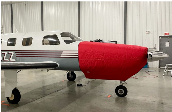
Malibu PA-46-310P Insulated Engine Cover

This cover type is made from Silver Acrylic Sunbrella canvas and is 100% lined with a soft and smooth microfiber. Bruce's Custom Covers developed this material combination especially for aircraft protection. The outer material is medium weight and treated for water resistance, UV resistance and anti-static buildup. The inner lining is a very soft and smooth microfiber to prevent scratching. The material is very reflective, and tests show that the cabin interior temperature can be reduced to near-ambient temperature on the hottest of days. It is water, ice and snow repellent, yet breathable to allow moisture to escape from between the cover and the aircraft surface.