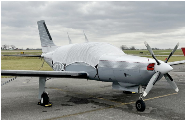
Piper PA46-350P Canopy Cover

Engine Inlet Plugs are custom fit for your Piper PA-46-350P Mirage, Matrix, JetProp intakes, made with heavy-duty vinyl material, and stuffed with a single block of sculpted urethane foam. Each plug has a zipper that allows the foam to be removed and dried if necessary. Engine plugs have warning flags that are visible from the cockpit or 'remove before flight' streamers sewn onto the face of the plugs. Most plugs are imprinted with the aircraft registration number in black for an extra charge. Storage bag NOT included. Engine plugs may be inserted after flight when the engine is still warm. Engine Inlet Plugs are commonly referred to as Cowl Plugs, Intake Plugs, Cowl Blocks, Engine Blocks, and Engine Bung.