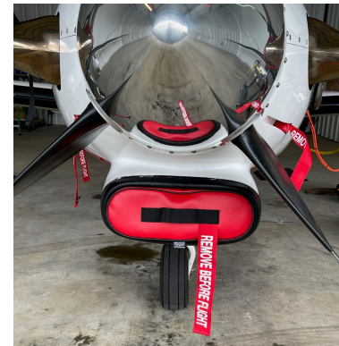
Piper Malibu JetProp Inlet Plugs