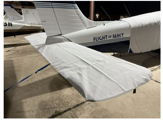
Piper PA-32 Horizontal Stabilizer/Tailcone Cover