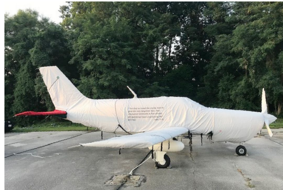
Piper Malibu, Mirage, Meridian Extended Canopy, Engine, Empennage & Wing Covers.