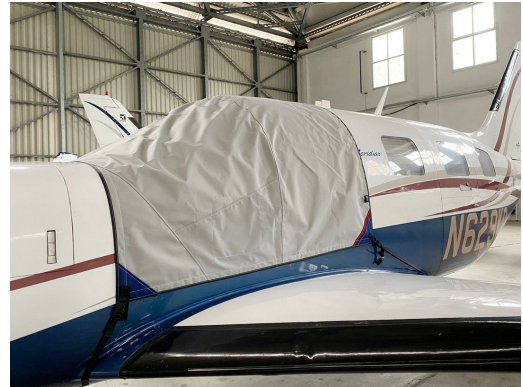
Piper PA-46-500TP Travel Cover Cockpit Cover