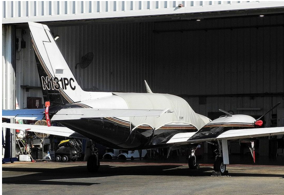
Piper PA-31T: Cheyenne, Cheyenne II XL Canopy Cover