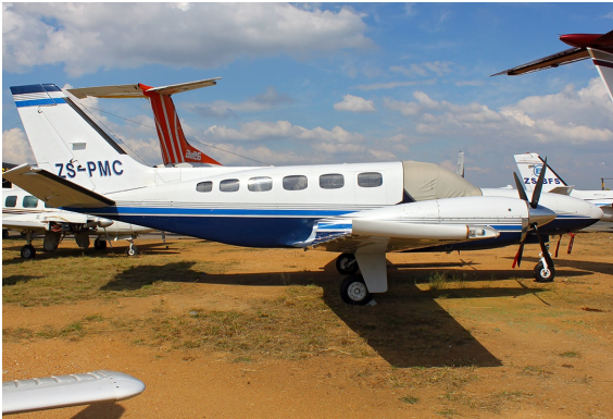
Cessna 441 Conquest II Cockpit Cover

This cover type is made from Silver Acrylic Sunbrella canvas and is 100% lined with a soft and smooth microfiber. Bruce's Custom Covers developed this material combination especially for aircraft protection. The outer material is medium weight and treated for water resistance, UV resistance and anti-static buildup. The inner lining is a very soft and smooth microfiber to prevent scratching. The material is very reflective, and tests show that the cabin interior temperature can be reduced to near-ambient temperature on the hottest of days. It is water, ice and snow repellent, yet breathable to allow moisture to escape from between the cover and the aircraft surface.