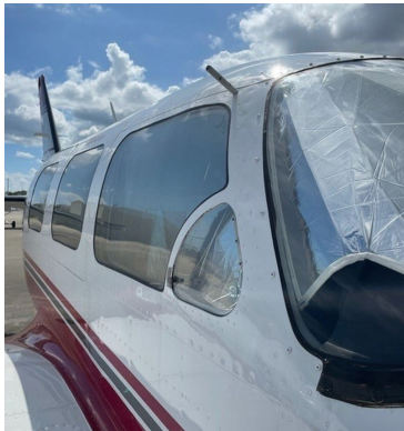
Piper PA-31 Models Cockpit HeatShields