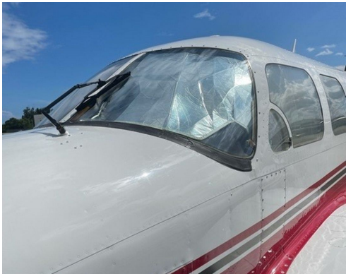
Piper PA-31 Models Cockpit HeatShields

Cockpit Heatshields are interior sunshades for the aircraft's cockpit. The product is a unique composite of closed-cell foam with a silver mylar finish. The semi-rigid design is stiff enough to stand inside the window framing. The set folds up flat and is easily stored in the included storage sleeve. Some designs may require velcro and suction cups. A Heatshield is an excellent short-term remedy for cockpit overheating, but an external fabric cover is more effective for long-term protection.