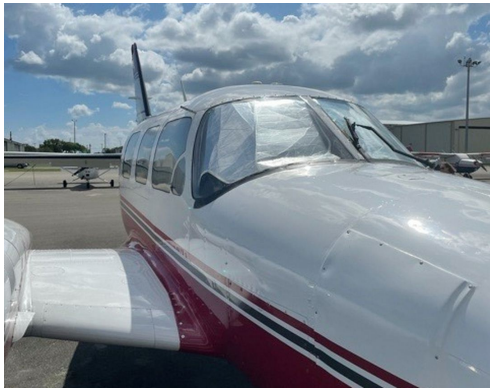
Piper PA-31 Models Cockpit HeatShields