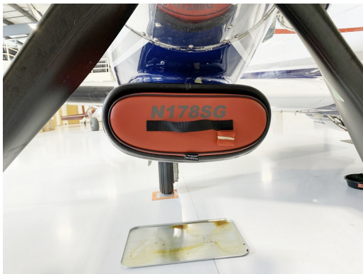
Piper Cheyenne Engine Inlet Plugs

Engine Inlet Plugs are custom fit for your Piper PA-31T: Cheyenne, Cheyenne II XL intakes, made with heavy-duty vinyl material, and stuffed with a single block of sculpted urethane foam. Each plug has a zipper that allows the foam to be removed and dried if necessary. Engine plugs have warning flags that are visible from the cockpit or 'remove before flight' streamers sewn onto the face of the plugs. Most plugs are imprinted with the aircraft registration number in black for an extra charge. Storage bag NOT included. Engine plugs may be inserted after flight when the engine is still warm. Engine Inlet Plugs are commonly referred to as Cowl Plugs, Intake Plugs, Cowl Blocks, Engine Blocks, and Engine Bungs.