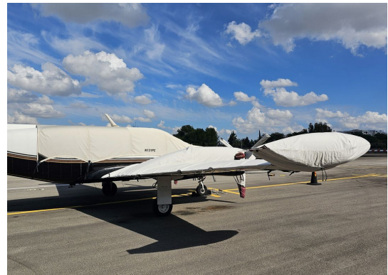
Piper PA-31T Cheyenne Canopy, Wing & Engine Covers