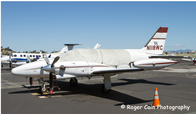
Piper PA-31T Cheyenne Canopy Cover