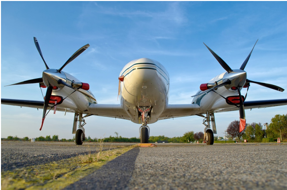
Piper Cheyenne Intake Plugs, Exhaust Covers, Prop Ties