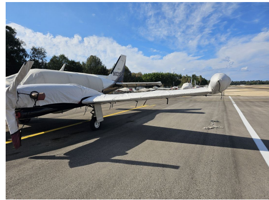
Piper PA-31T Cheyenne Canopy, Wing & Engine Covers