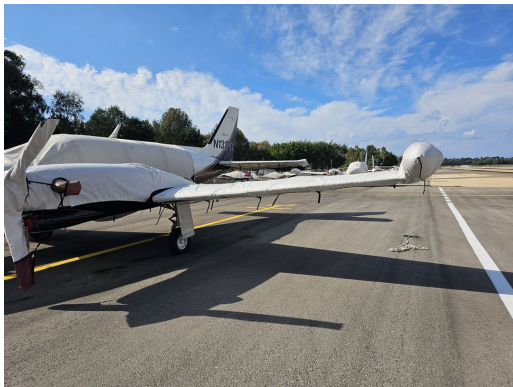
Piper PA-31T Cheyenne Canopy, Wing & Engine Covers

WINTER USE MATERIAL - Made with Solution-Dyed Polyester fabric, this option is intended for seasonal use to aid in deicing, rain mitigation, or for occasional travel. The material is lighter and more compact, but more susceptible to UV damage and may have a shorter useful life if used continuously outside than the all-year use material.