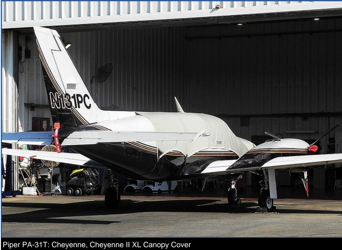
Piper PA-31T: Cheyenne, Cheyenne II XL Canopy Cover