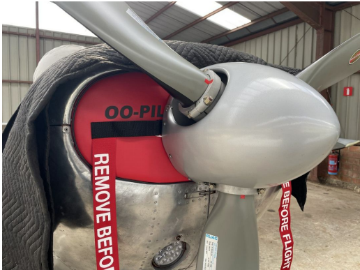
Pilatus P-3 Engine Plugs

Engine Inlet Plugs are custom fit for your Pilatus P-3 intakes, made with heavy-duty vinyl material, and stuffed with a single block of sculpted urethane foam. Each plug has a zipper that allows the foam to be removed and dried if necessary. Engine plugs have warning flags that are visible from the cockpit or 'remove before flight' streamers sewn onto the face of the plugs. Most plugs are imprinted with the aircraft registration number in black for an extra charge. Storage bag NOT included. Engine plugs may be inserted after flight when the engine is still warm. Engine Inlet Plugs are commonly referred to as Cowl Plugs, Intake Plugs, Cowl Blocks, Engine Blocks, and Engine Bungs.