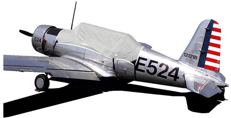
BT-13 Canopy Cover