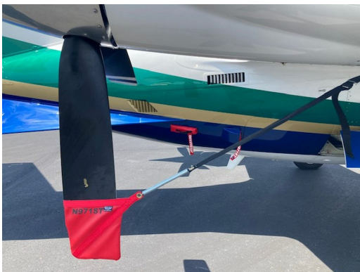
Piaggio P180 Prop Ties

This cover type is made from Silver Acrylic Sunbrella canvas and is 100% lined with a soft and smooth microfiber. Bruce's Custom Covers developed this material combination especially for aircraft protection. The outer material is medium weight and treated for water resistance, UV resistance and anti-static buildup. The inner lining is a very soft and smooth microfiber to prevent scratching. The material is very reflective, and tests show that the cabin interior temperature can be reduced to near-ambient temperature on the hottest of days. It is water, ice and snow repellent, yet breathable to allow moisture to escape from between the cover and the aircraft surface.