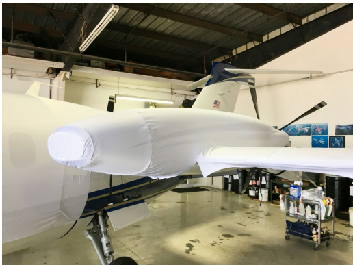
Piaggio P180 Fuselage/Canard Cover & Wing/Engine Covers (test fit covers)

WINTER USE MATERIAL - Made with Solution-Dyed Polyester fabric, this option is intended for seasonal use to aid in deicing, rain mitigation, or for occasional travel. The material is lighter and more compact, but more susceptible to UV damage and may have a shorter useful life if used continuously outside than the all-year use material.