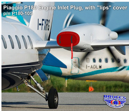
Piaggio 180 Engine Inlet Plugs with extension to cover "lips"

Engine Inlet Plugs are custom fit for your Piaggio Avanti P180 intakes, made with heavy-duty vinyl material, and stuffed with a single block of sculpted urethane foam. Each plug has a zipper that allows the foam to be removed and dried if necessary. Engine plugs have warning flags that are visible from the cockpit or 'remove before flight' streamers sewn onto the face of the plugs. Most plugs are imprinted with the aircraft registration number in black for an extra charge. Storage bag NOT included. Engine plugs may be inserted after flight when the engine is still warm. Engine Inlet Plugs are commonly referred to as Cowl Plugs, Intake Plugs, Cowl Blocks, Engine Blocks, and Engine Bungs.