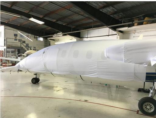
Piaggio 180 Cockpit/Nose Cover, Travel Weight Piaggio P180 Fuselage/Canard Cover & Wing/Engine Covers (test fit covers)