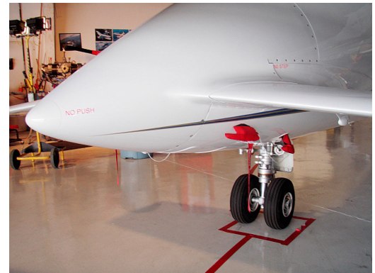
Piaggio 180 Pitot & Rosemount Covers