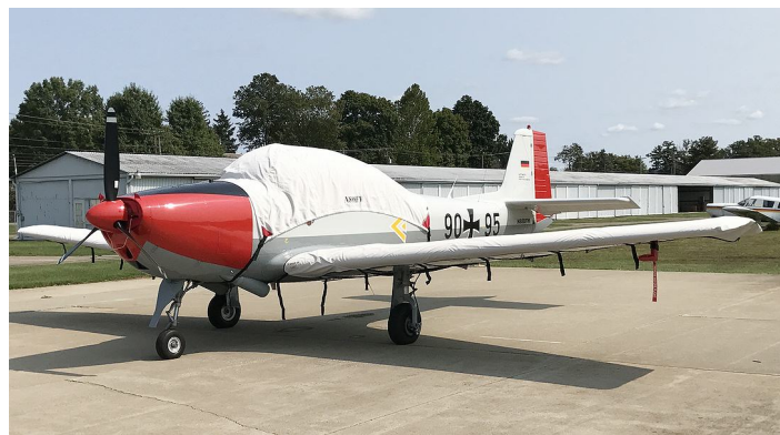
Focke Wulf F149 Canopy Cover, Wing Covers, Engine Plugs

Engine Inlet Plugs are custom fit for your Piaggio P-149 intakes, made with heavy-duty vinyl material, and stuffed with a single block of sculpted urethane foam. Each plug has a zipper that allows the foam to be removed and dried if necessary. Engine plugs have warning flags that are visible from the cockpit or 'remove before flight' streamers sewn onto the face of the plugs. Most plugs are imprinted with the aircraft registration number in black for an extra charge. Storage bag NOT included. Engine plugs may be inserted after flight when the engine is still warm. Engine Inlet Plugs are commonly referred to as Cowl Plugs, Intake Plugs, Cowl Blocks, Engine Blocks, and Engine Bunges.