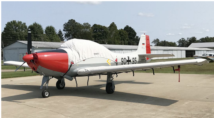
Focke Wulf F149 Canopy Cover, Wing Covers, Engine Plugs