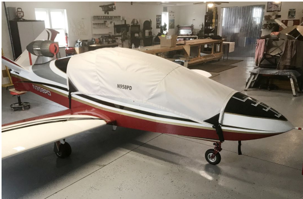
Subsonex Canopy Cover