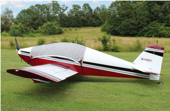
OneX Canopy Cover