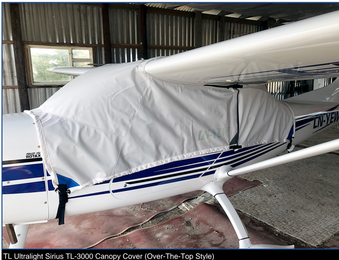
TL Ultralight Sirius TL-3000 Canopy Cover (Over-The-Top Style)