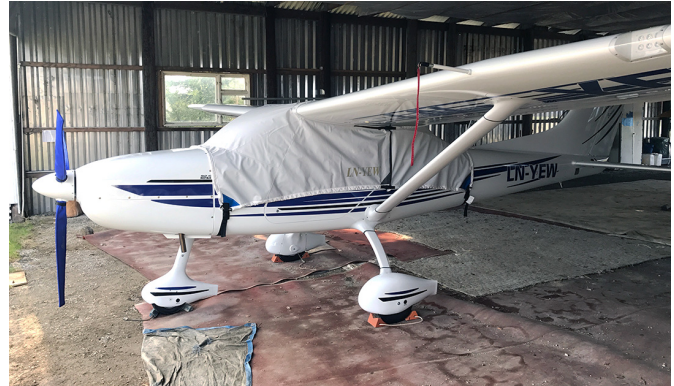
TL Ultralight Sirius TL-3000 Canopy Cover (Over-The-Top Style)