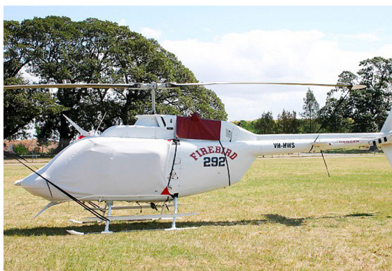
206B Bubble Cover