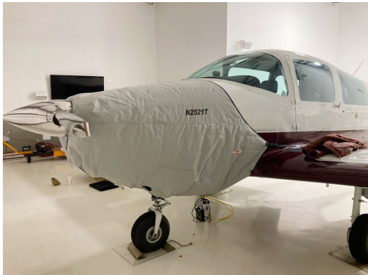
NAVION H Insulated Engine Cover

This cover type is made from Silver Acrylic Sunbrella canvas and is 100% lined with a soft and smooth microfiber. Bruce's Custom Covers developed this material combination especially for aircraft protection. The outer material is medium weight and treated for water resistance, UV resistance and anti-static buildup. The inner lining is a very soft and smooth microfiber to prevent scratching. The material is very reflective, and tests show that the cabin interior temperature can be reduced to near-ambient temperature on the hottest of days. It is water, ice and snow repellent, yet breathable to allow moisture to escape from between the cover and the aircraft surface.