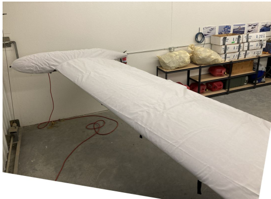
Navion Rangemaster Wing Covers

shorter useful life if used continuously outside than the all-year use material.