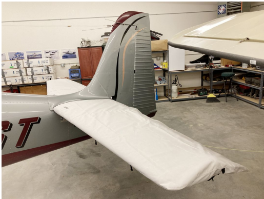
Navion Rangemaster Horizontal Stabilizer Covers