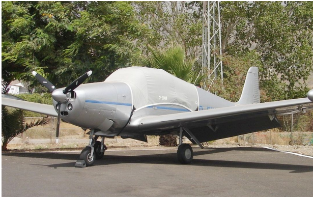
Navion Rangemaster Canopy Cover