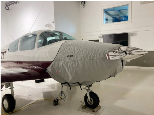
NAVION H Insulated Engine Cover