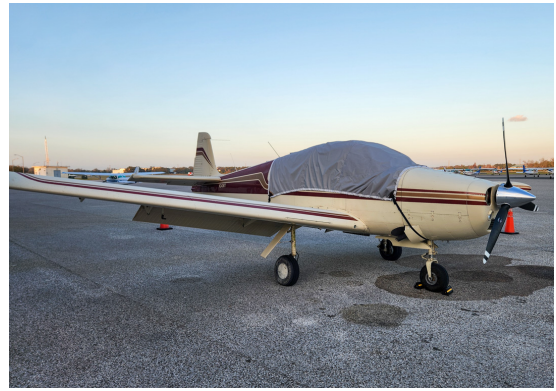
Navion Rangemaster Travel Cover, Light Weight Canopy Cover, Navion Rangemaster Travel Cover, Light Weight Canopy Cover, (Super Slope windshield) (Super Slope windshield)