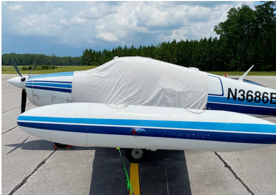
Navion Rangemaster Extended Canopy Cover

This cover type is made from Silver Acrylic Sunbrella canvas and is 100% lined with a soft and smooth microfiber. Bruce's Custom Covers developed this material combination especially for aircraft protection. The outer material is medium weight and treated for water resistance, UV resistance and anti-static buildup. The inner lining is a very soft and smooth microfiber to prevent scratching. The material is very reflective, and tests show that the cabin interior temperature can be reduced to near-ambient temperature on the hottest of days. It is water, ice and snow repellent, yet breathable to allow moisture to escape from between the cover and the aircraft surface.