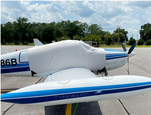
Navion Rangemaster Extended Canopy Cover