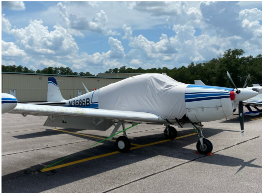
Navion Rangemaster Extended Canopy Cover

This cover type is made from Silver Acrylic Sunbrella canvas and is 100% lined with a soft and smooth microfiber. Bruce's Custom Covers developed this material combination especially for aircraft protection. The outer material is medium weight and treated for water resistance, UV resistance and anti-static buildup. The inner lining is a very soft and smooth microfiber to prevent scratching. The material is very reflective, and tests show that the cabin interior temperature can be reduced to near-ambient temperature on the hottest of days. It is water, ice and snow repellent, yet breathable to allow moisture to escape from between the cover and the aircraft surface.