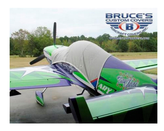
MX-2 Canopy Cover