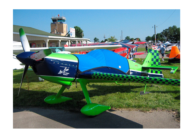
MX-2 Canopy Cover