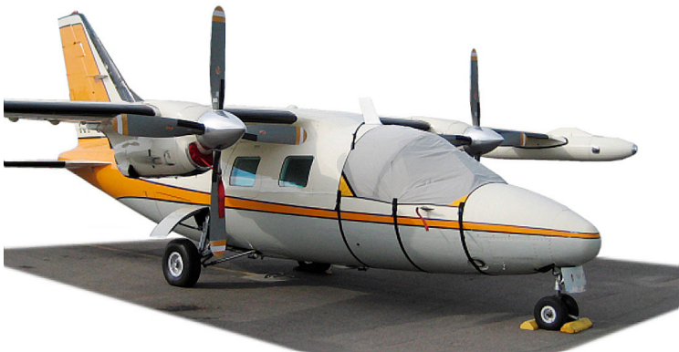
MU-2 Windshield Cover & Engine Plugs