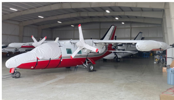
MU-2 Cockpit/Nose, Wing/Engine & Prop Covers