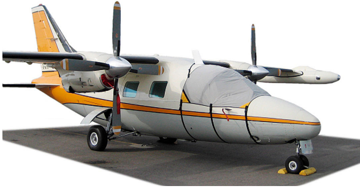
MU-2 Windshield Cover & Engine Plugs

This cover type is made from Silver Acrylic Sunbrella canvas and is 100% lined with a soft and smooth microfiber. Bruce's Custom Covers developed this material combination especially for aircraft protection. The outer material is medium weight and treated for water resistance, UV resistance and anti-static buildup. The inner lining is a very soft and smooth microfiber to prevent scratching. The material is very reflective, and tests show that the cabin interior temperature can be reduced to near-ambient temperature on the hottest of days. It is water, ice and snow repellent, yet breathable to allow moisture to escape from between the cover and the aircraft surface.