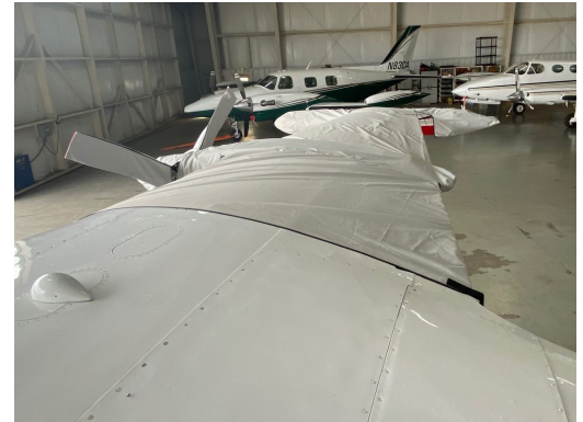
MU-2 Wing/Engine Covers