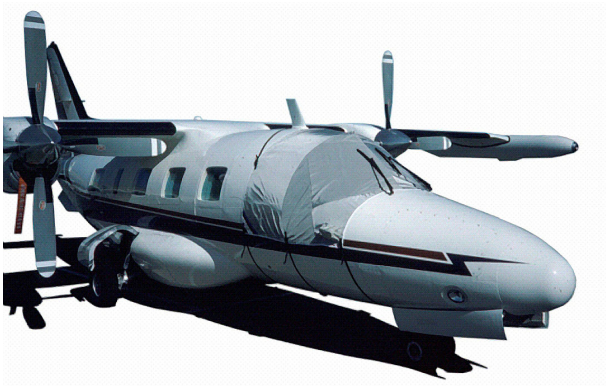
MU-2 Windshield Cover & Engine Plugs

Travel Covers are made with Silver Solution-Dyed Polyester fabric and only lined over the windshield to save weight. The material is lightweight and more compact for easy stowage in the aircraft. The polyester material is water resistant, but only intended for occasional use outside. We also have an ultra lightweight material available for fitted hangar dust covers. For daily outdoor use, the non-travel Sunbrella Cover is the best choice.