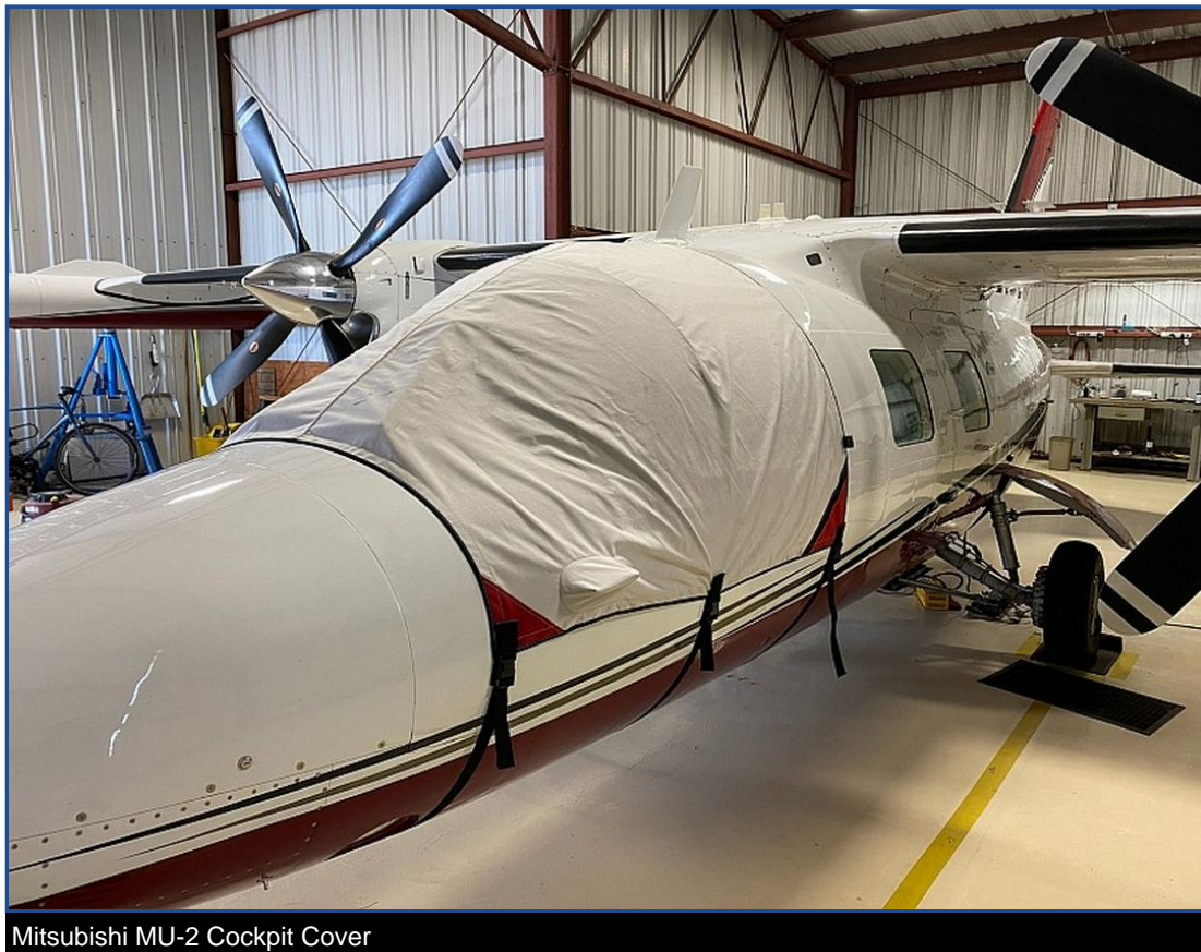
Mitsubishi MU-2 Cockpit Cover