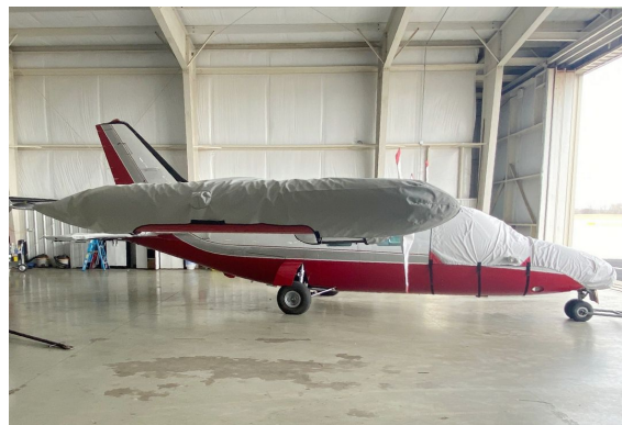
MU-2 Cockpit/Nose, Wing/Engine &amp; Prop Covers