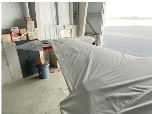
MU-2 Wing/Engine Covers

WINTER USE MATERIAL - Made with Solution-Dyed Polyester fabric, this option is intended for seasonal use to aid in deicing, rain mitigation, or for occasional travel. The material is lighter and more compact, but more susceptible to UV damage and may have a shorter useful life if used continuously outside than the all-year use material.