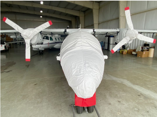
MU-2 Cockpit/Nose, Wing/Engine & Prop Covers