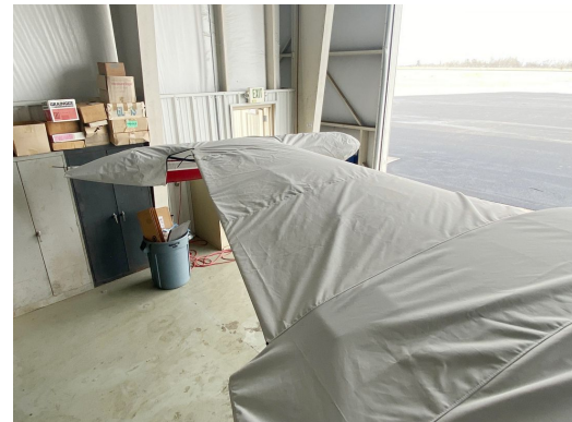
MU-2 Wing/Engine Covers