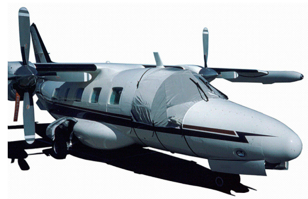
MU-2 Windshield Cover & Engine Plugs