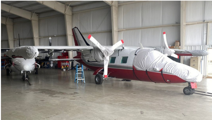
MU-2 Cockpit/Nose, Wing/Engine &amp; Prop Covers