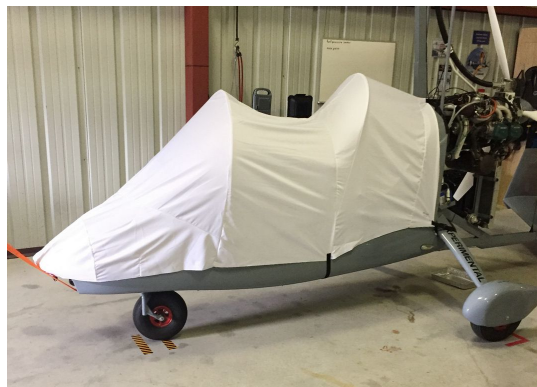
Magni M16 Autogyro Canopy/Nose Cover, test fit cover