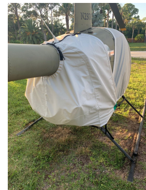
Robinson R-22 Engine Cover