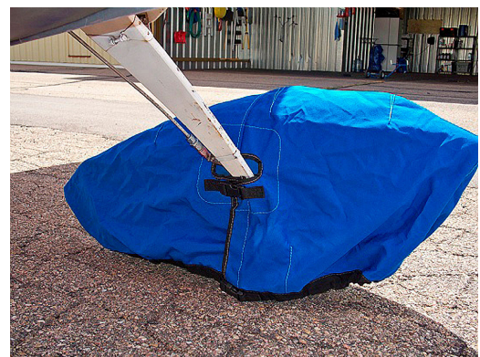
Bellanca Citabria Wheelpant Cover