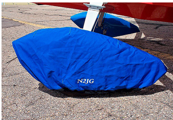
Bellanca Citabria Wheelpant Cover

ALL-YEAR USE MATERIAL - Made with Silver Acrylic Sunbrella canvas, the all-year use material is the best option for sun protection and cover longevity. This heavier more durable material is intended for all weather conditions, such as rain and snow or lots of sun.