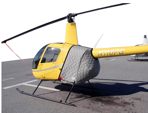
Robinson R-22 Insulated Engine Cover (also covers bottom) & Front Blade Tie-down

Bruce's Autogyro MTO Sport, 2010, 2017 Gyrocopter Blade Covers are made of medium-weight Solution-Dyed Polyester and designed to avoid trim tabs or wicks. You can install Blade Covers from the ground with the aid of a lightweight rope attached to the open end. Covers are cinched tight at the blade root with straps and quick-release plastic buckles. The Cold Weather Blade Covers are fitted with full-length zippers and optional deice "boots" designed to accept a preheater hose; a small opening at the tip of the cover allows for some air circulation and drainage in freezing weather. Some part numbers have features for an extra charge.