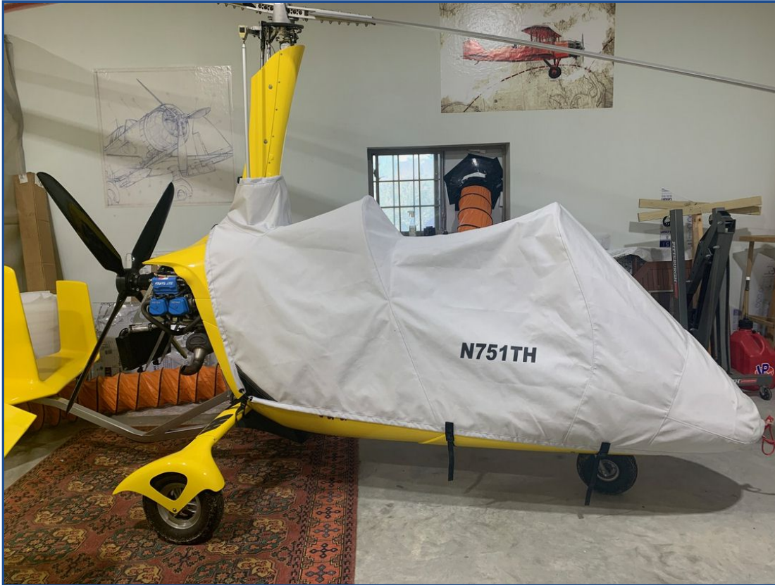
MTO Sport Canopy/Nose Cover