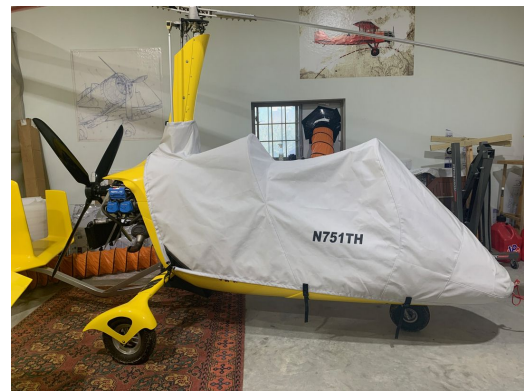
MTO Sport Canopy/Nose Cover