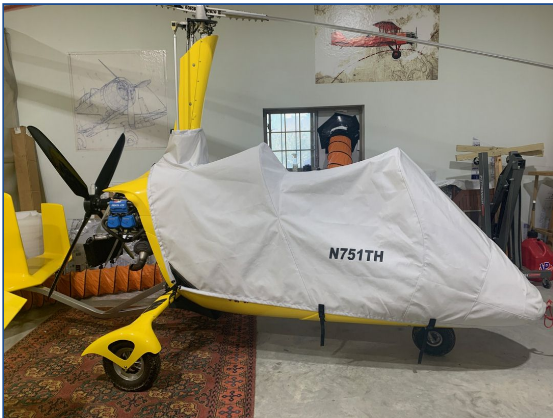
MTO Sport Canopy/Nose Cover