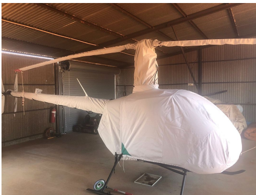
Robinson R-22 Full Cover Set

Bruce's Autogyro MTO Sport, 2010, 2017 Gyrocopter Blade Covers are made of medium-weight Solution-Dyed Polyester and designed to avoid trim tabs or wicks. You can install Blade Covers from the ground with the aid of a lightweight rope attached to the open end. Covers are cinched tight at the blade root with straps and quick-release plastic buckles. The Cold Weather Blade Covers are fitted with full-length zippers and optional deice "boots" designed to accept a preheater hose; a small opening at the tip of the cover allows for some air circulation and drainage in freezing weather. Some part numbers have features for an extra charge.