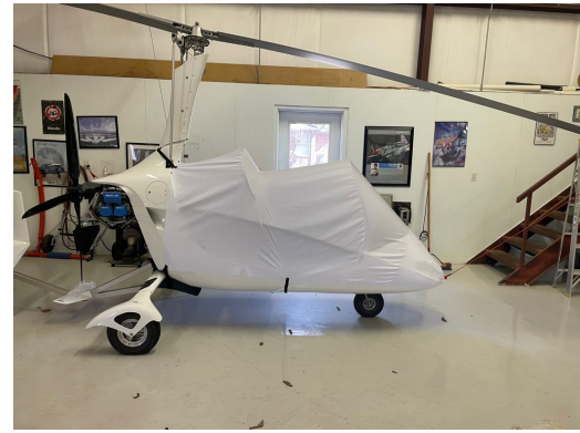
MTO Sport Gyrocopter Canopy/Nose Cover, test fit cover