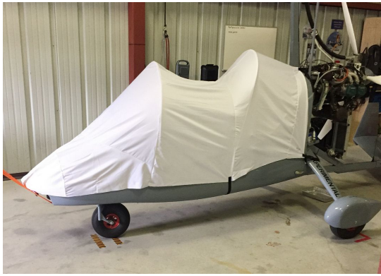
Magni M16 Autogyro Canopy/Nose Cover, test fit cover