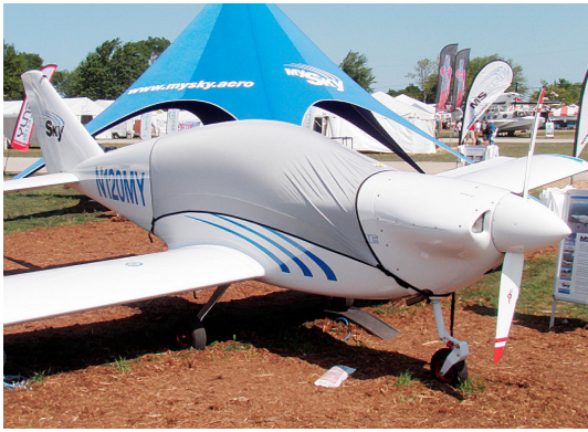
Mysky Fly-Away Travel Cover