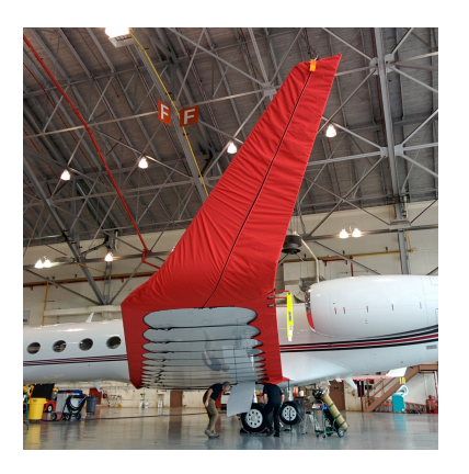
Gulfstream G550 Wing/Winglet Covers