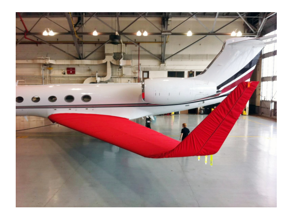
Gulfstream G550 Wing/Winglet Covers

WINTER USE MATERIAL - Made with Solution-Dyed Polyester fabric, this option is intended for seasonal use to aid in deicing, rain mitigation, or for occasional travel. The material is lighter and more compact, but more susceptible to UV damage and may have a shorter useful life if used continuously outside than the all-year use material.