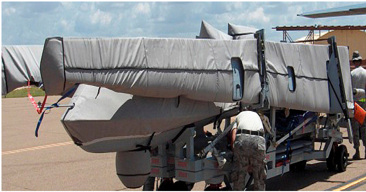
MQ1 Fuselage and Wing Covers