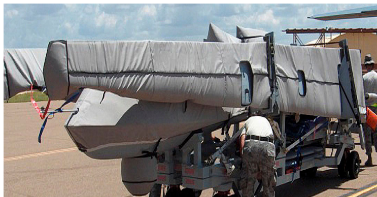
MQ1 Fuselage and Wing Covers