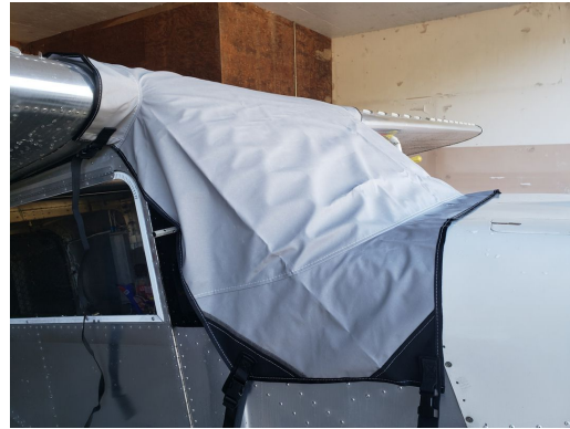
Murphy Rebel, Moose, Renegade, Spirit, Elite, etc. Windshield/Skylight Cover