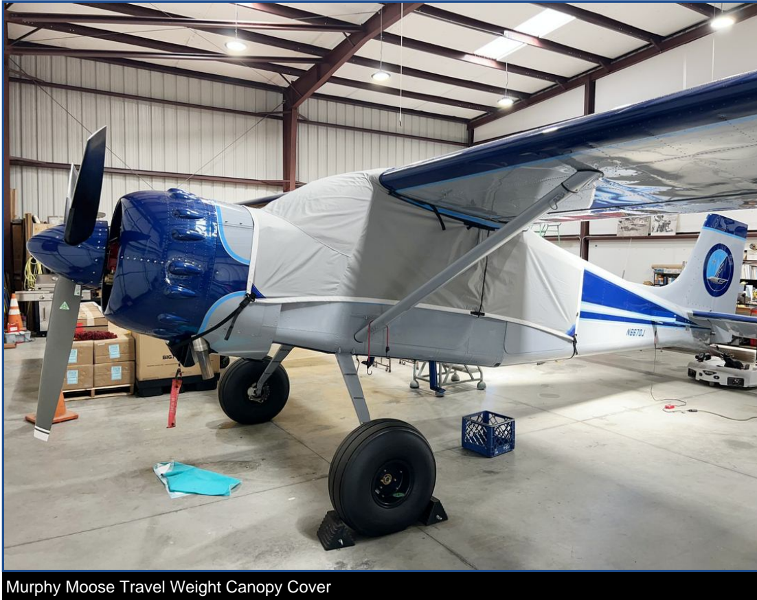
Murphy Moose Travel Weight Canopy Cover