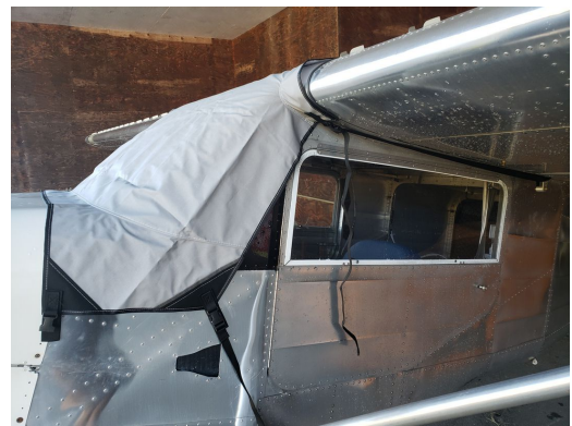
Murphy Rebel, Moose, Renegade, Spirit, Elite, etc. Windshield/Skylight Cover