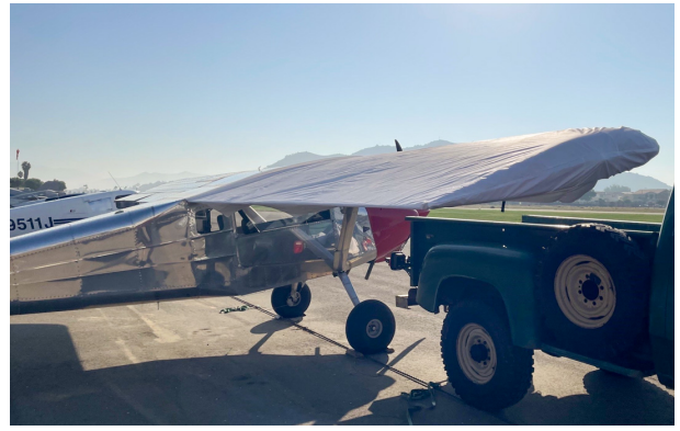
Murphy Elite Wing Covers, test fit cover