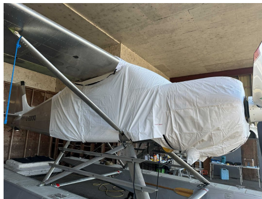
Murphy Moose Extended Canopy Cover, Engine & Prop Covers, test fit covers. Murphy Moose Extended Canopy Cover, Engine & Prop Covers, test fit covers.