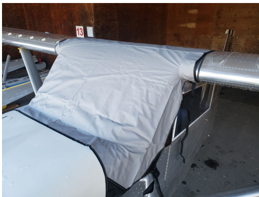
Murphy Rebel, Moose, Renegade, Spirit, Elite, etc. Windshield/Skylight Cover

This cover type is made from Silver Acrylic Sunbrella canvas and is 100% lined with a soft and smooth microfiber. Bruce's Custom Covers developed this material combination especially for aircraft protection. The outer material is medium weight and treated for water resistance, UV resistance and anti-static buildup. The inner lining is a very soft and smooth microfiber to prevent scratching. The material is very reflective, and tests show that the cabin interior temperature can be reduced to near-ambient temperature on the hottest of days. It is water, ice and snow repellent, yet breathable to allow moisture to escape from between the cover and the aircraft surface.