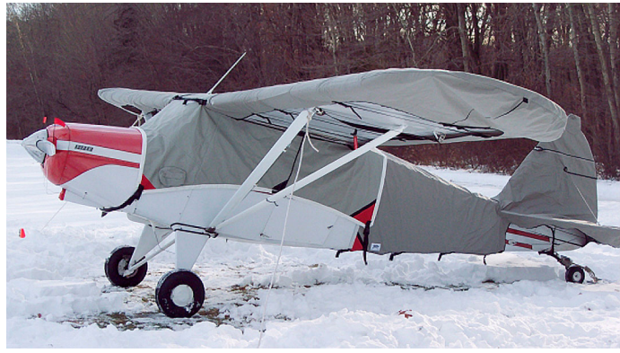
Piper Clipper Canopy Cover, Empennage & Wing Covers, Engine Plugs