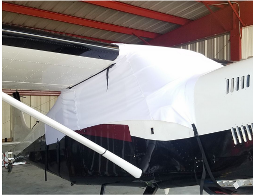
Murphy Moose Canopy Cover (test fit cover)

Covers developed this material combination especially for aircraft protection. The outer material is medium weight and treated for water resistance, UV resistance and anti-static buildup. The inner lining is a very soft and smooth microfiber to prevent scratching. The material is very reflective, and tests show that the cabin interior temperature can be reduced to near-ambient temperature on the hottest of days. It is water, ice and snow repellent, yet breathable to allow moisture to escape from between the cover and the aircraft surface.