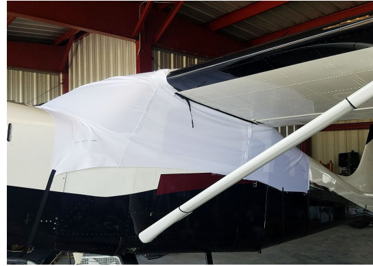
Murphy Moose Canopy Cover (test fit cover)