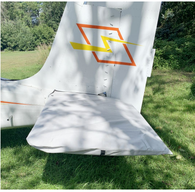
Murphy Elite Horizontal Stabilizer Covers