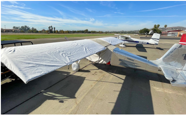
Murphy Elite Wing Covers