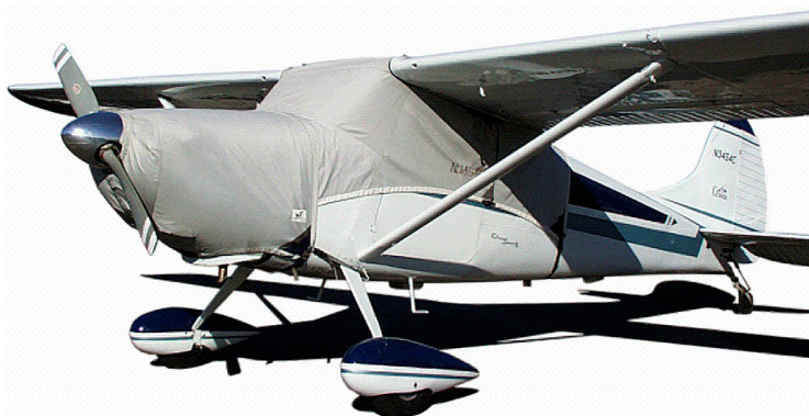
Cessna 170 Canopy Cover & Engine Cover