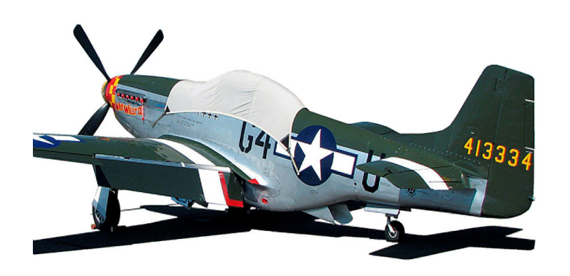
North American P51 Canopy Cover & Exhaust Plugs