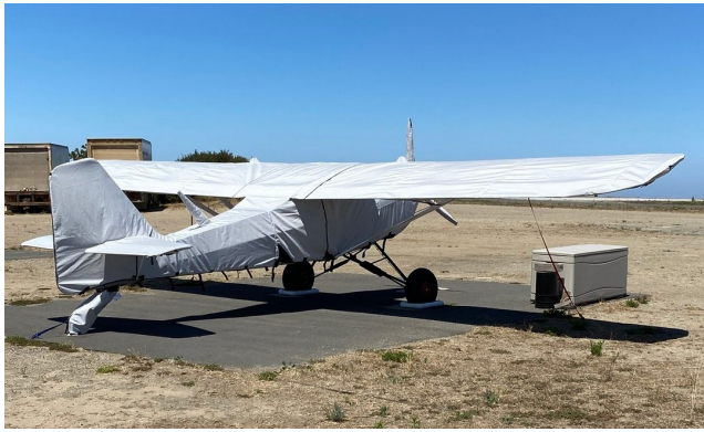
Kitfox Full Cover Set