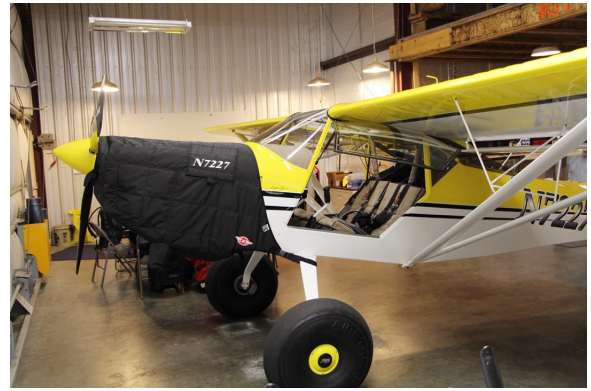
Kitfox Insulated Engine Cover