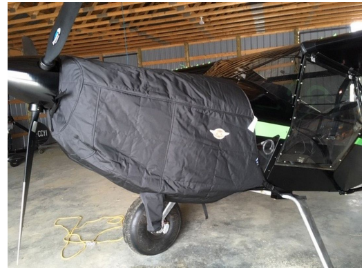
Kitfox V Insulated Engine Cover