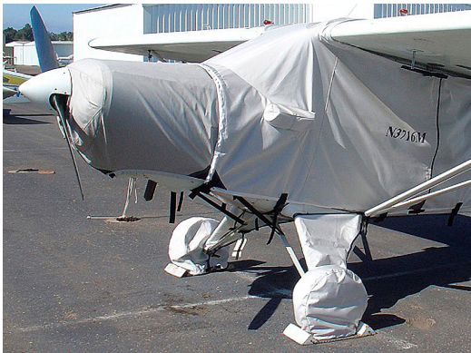
Piper PA-12 Landing Gear Covers

ALL-YEAR USE MATERIAL - Made with Silver Acrylic Sunbrella canvas, the all-year use material is the best option for sun protection and cover longevity. This heavier more durable material is intended for all weather conditions, such as rain and snow or lots of sun.