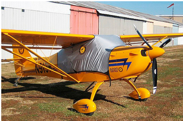
Aerotrek A220 Fitted Hangar Dust Cover