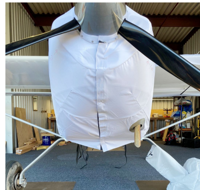
Kitfox Extended Canopy/Engine Cover, test fit cover