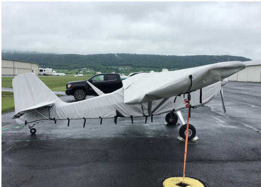
Kitfox 5 Complete Cover Set