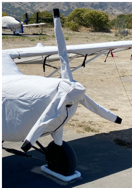
Kitfox Full Cover Set