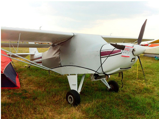
Kitfox Spandex FlyAway Travel Canopy Cover

Travel Covers are made with Silver Solution-Dyed Polyester fabric and only lined over the windshield to save weight. The material is lightweight and more compact for easy stowage in the aircraft. The polyester material is water resistant, but only intended for occasional use outside. We also have an ultra lightweight material available for fitted hangar dust covers. For daily outdoor use, the non-travel Sunbrella Cover is the best choice.