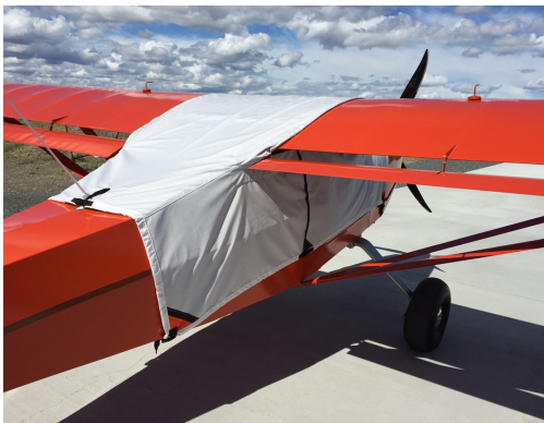
Kitfox IV Over-the-top Canopy Cover

This cover type is made from Silver Acrylic Sunbrella canvas and is 100% lined with a soft and smooth microfiber. Bruce's Custom Covers developed this material combination especially for aircraft protection. The outer material is medium weight and treated for water resistance, UV resistance and anti-static buildup. The inner lining is a very soft and smooth microfiber to prevent scratching. The material is very reflective, and tests show that the cabin interior temperature can be reduced to near-ambient temperature on the hottest of days. It is water, ice and snow repellent, yet breathable to allow moisture to escape from between the cover and the aircraft surface.