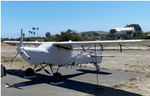
Kitfox Full Cover Set

WINTER USE MATERIAL - Made with Solution-Dyed Polyester fabric, this option is intended for seasonal use to aid in deicing, rain mitigation, or for occasional travel. The material is lighter and more compact, but more susceptible to UV damage and may have a shorter useful life if used continuously outside than the all-year use material.