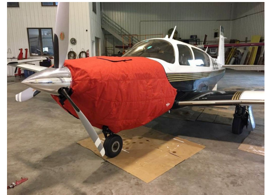
Mooney Ovation Insulated Engine Cover