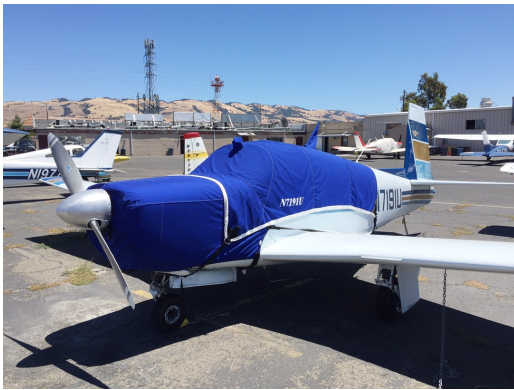
Mooney M20 Canopy & Engine Cover

This cover type is made from Silver Acrylic Sunbrella canvas and is 100% lined with a soft and smooth microfiber. Bruce's Custom Covers developed this material combination especially for aircraft protection. The outer material is medium weight and treated for water resistance, UV resistance and anti-static buildup. The inner lining is a very soft and smooth microfiber to prevent scratching. The material is very reflective, and tests show that the cabin interior temperature can be reduced to near-ambient temperature on the hottest of days. It is water, ice and snow repellent, yet breathable to allow moisture to escape from between the cover and the aircraft surface.