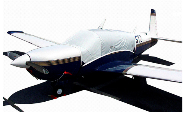
Porsche Mooney Canopy Cover & Plugs