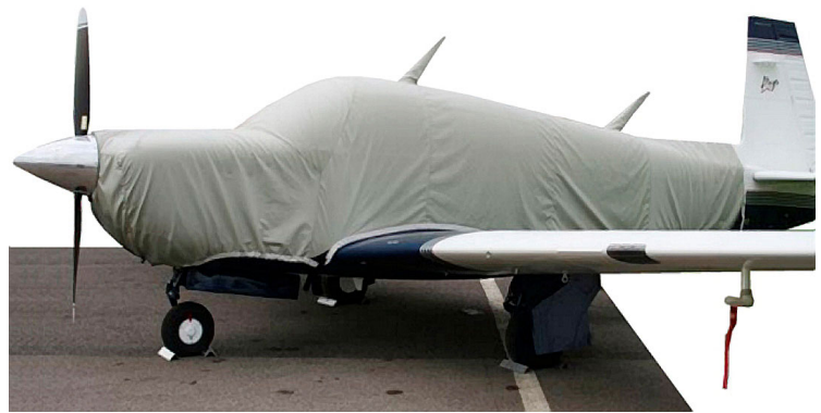
Mooney M20 Extra Extended Canopy/Engine Cover